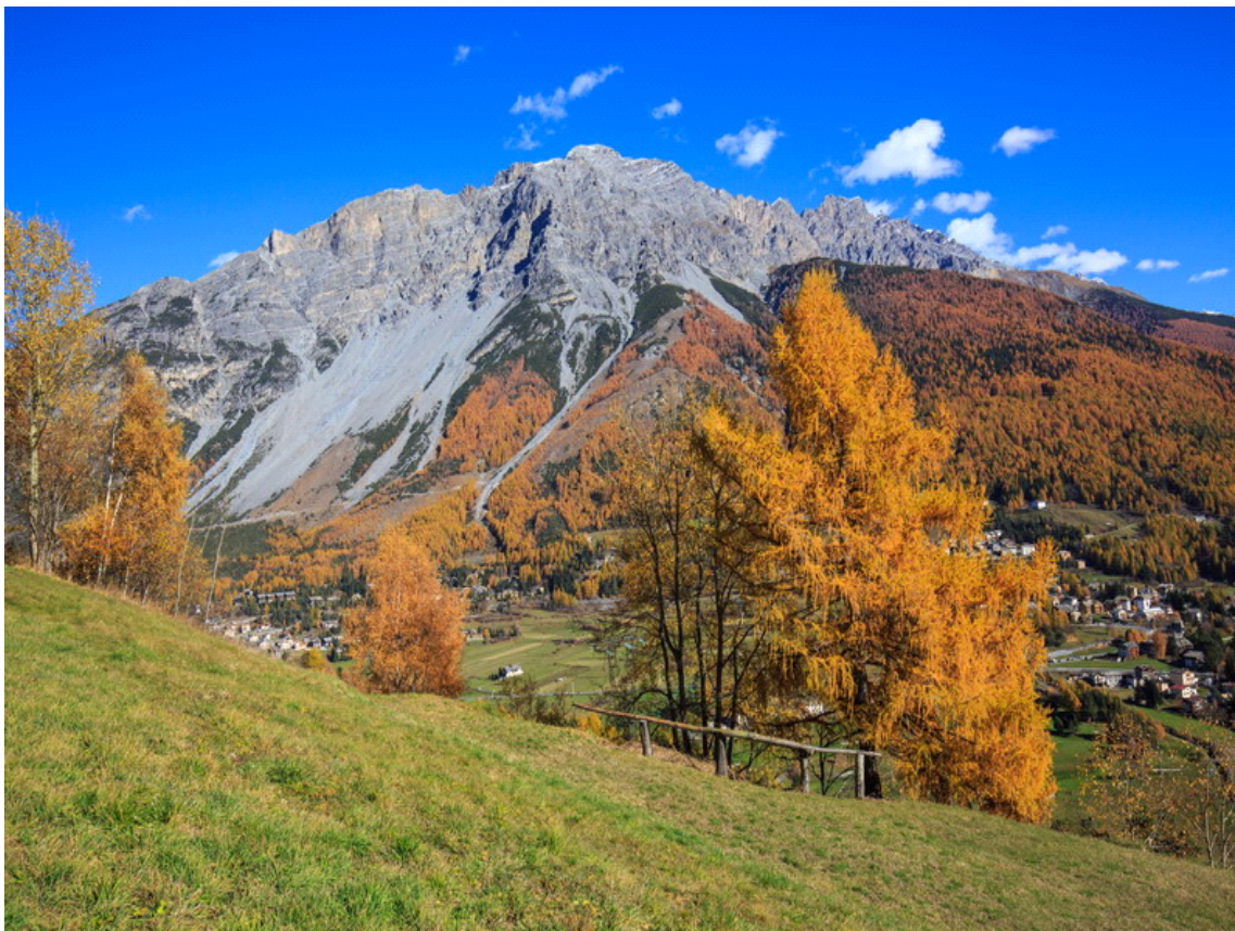
Reit in autunno