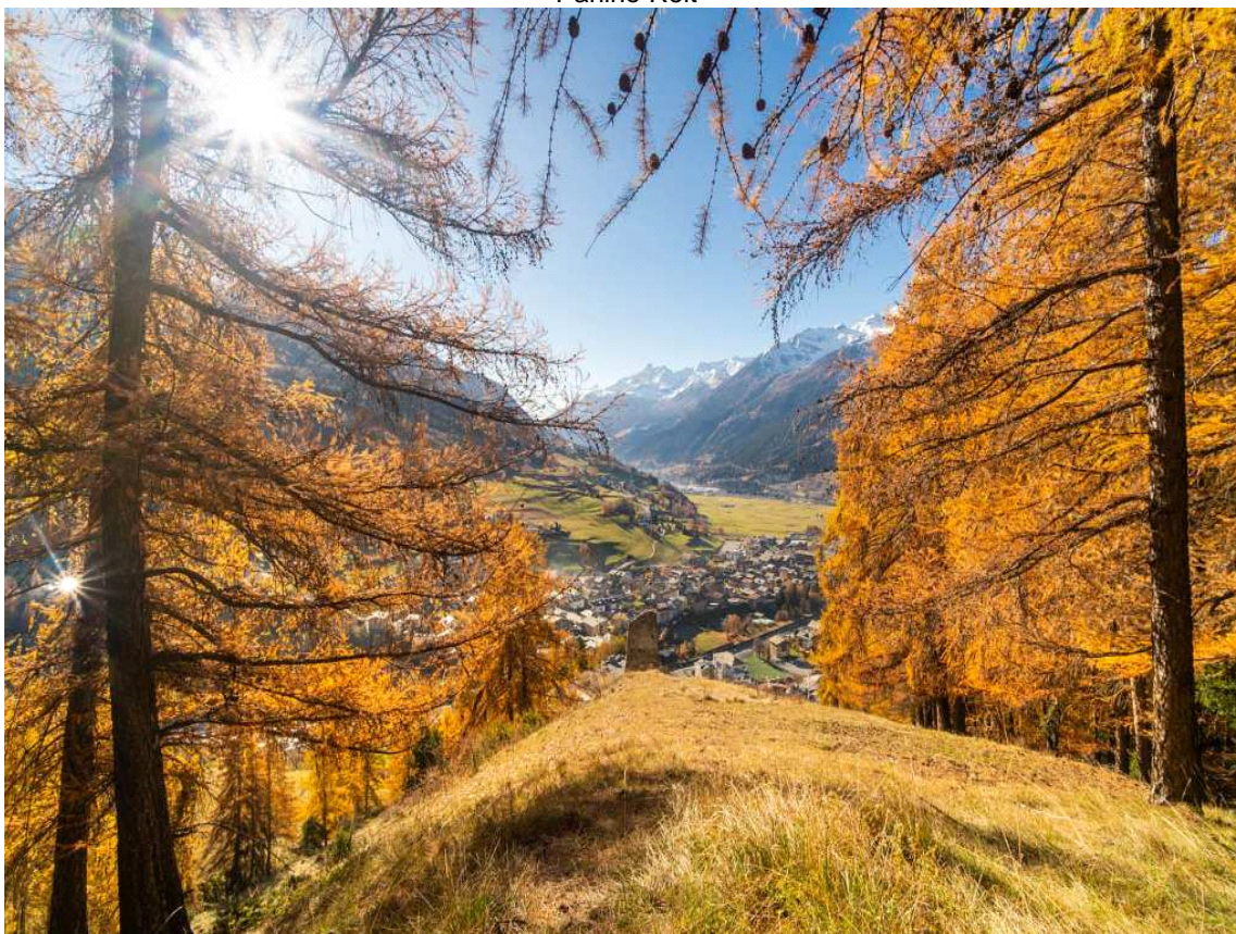
Paesaggi Bormio Autunno