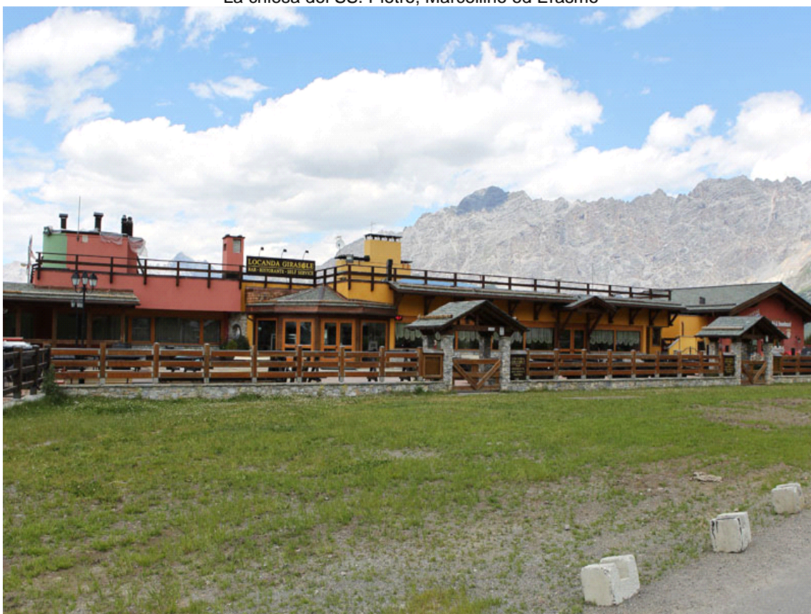
A Bormio 2000

This publication is for information purposes only. We recommend you consult and check the weather forecast and snow conditions before every excursion.