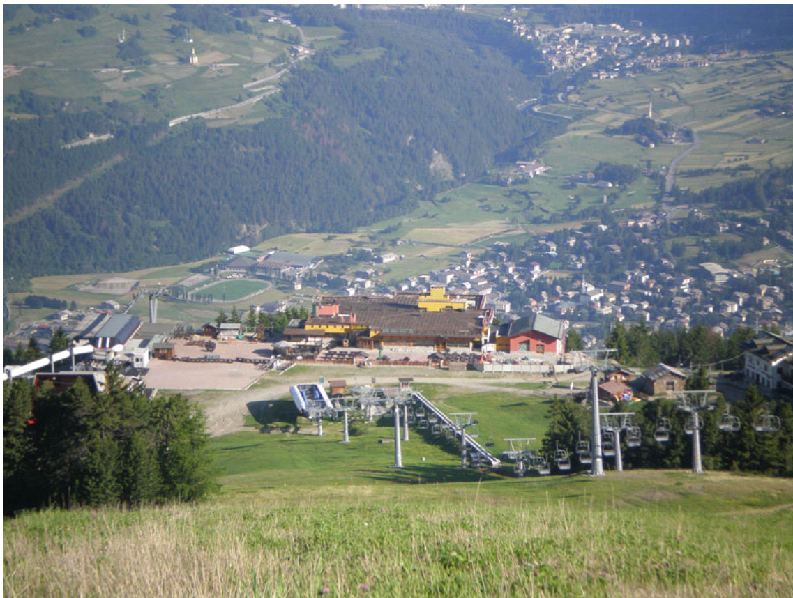
Vista di Bormio da quota 2000