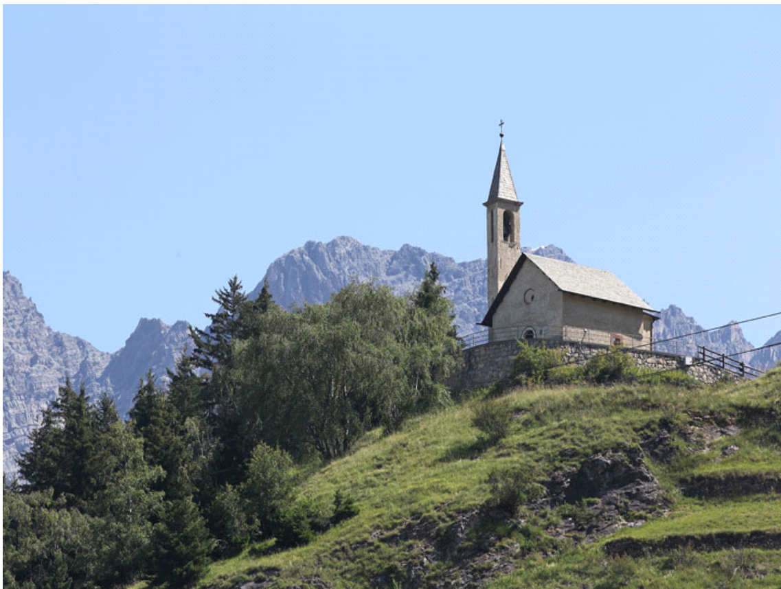
La chiesa dei SS. Pietro, Marcellino ed Erasmo