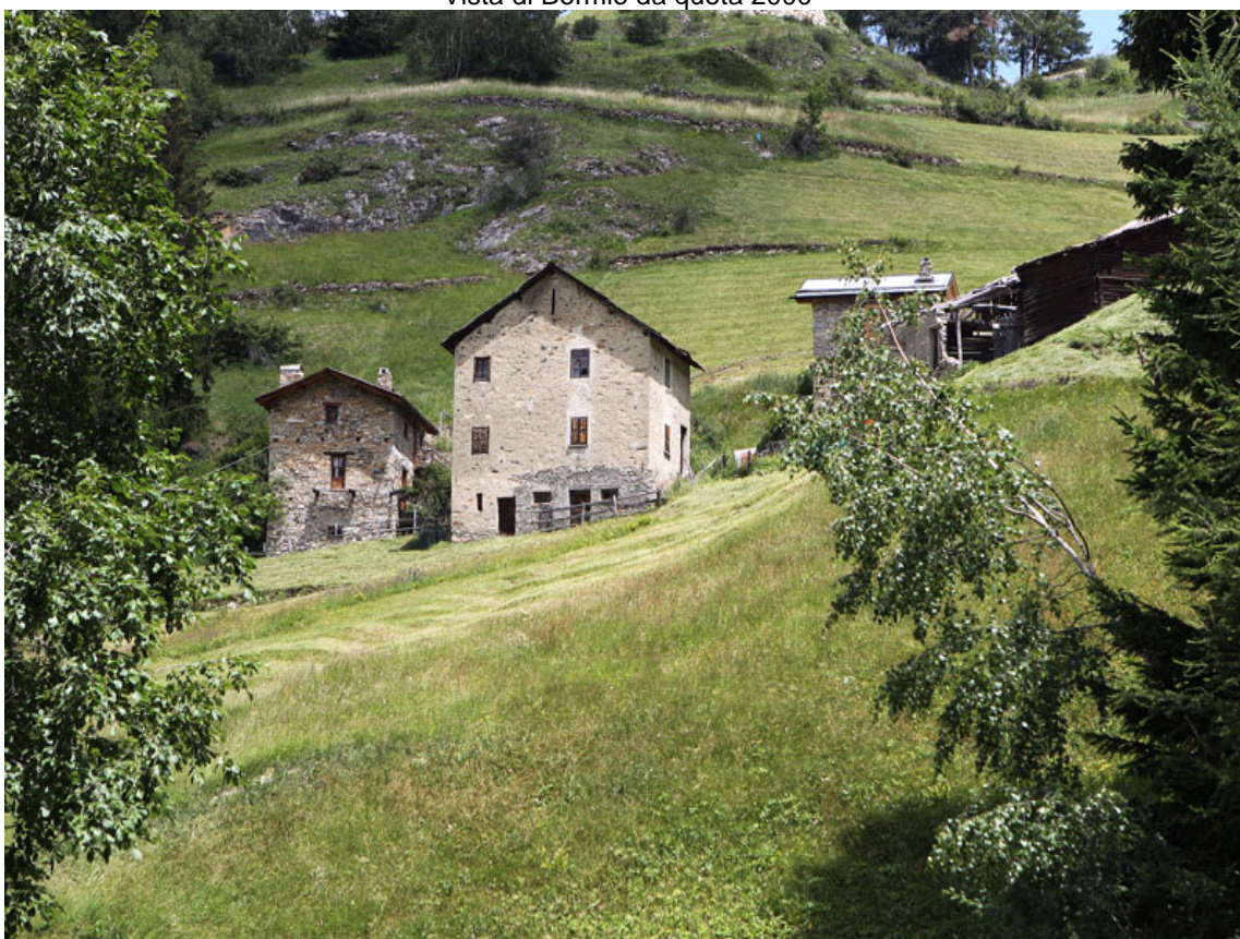
Baite sotto il Ciuk