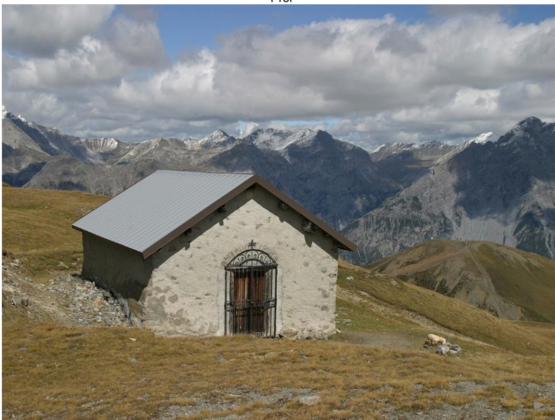
Chiesetta di San Colombano

This publication is for information purposes only. We recommend you consult and check the weather forecast and snow conditions before every excursion.