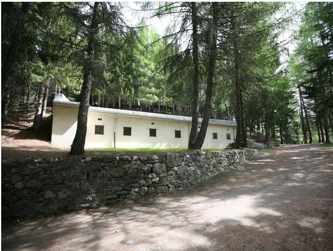
Forte di Oga