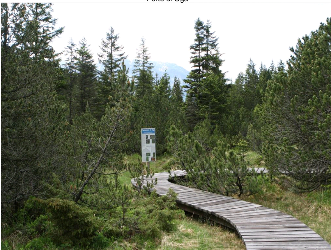
La riserva del Paluaccio

This publication is for information purposes only. We recommend you consult and check the weather forecast and snow conditions before every excursion.