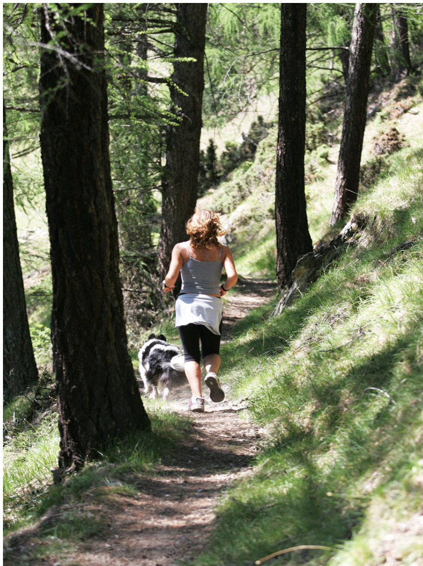
Di corsa lungo il percorso nel bosco Suena