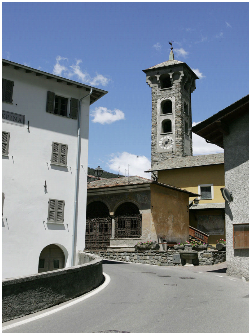
La chiesa di Santa Maria Assunta

This publication is for information purposes only. We recommend you consult and check the weather forecast and snow conditions before every excursion.