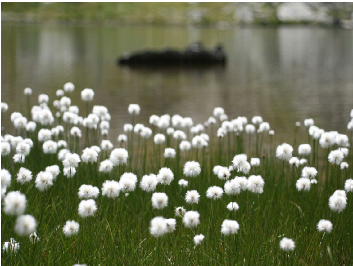
Il laghetto delle libellule