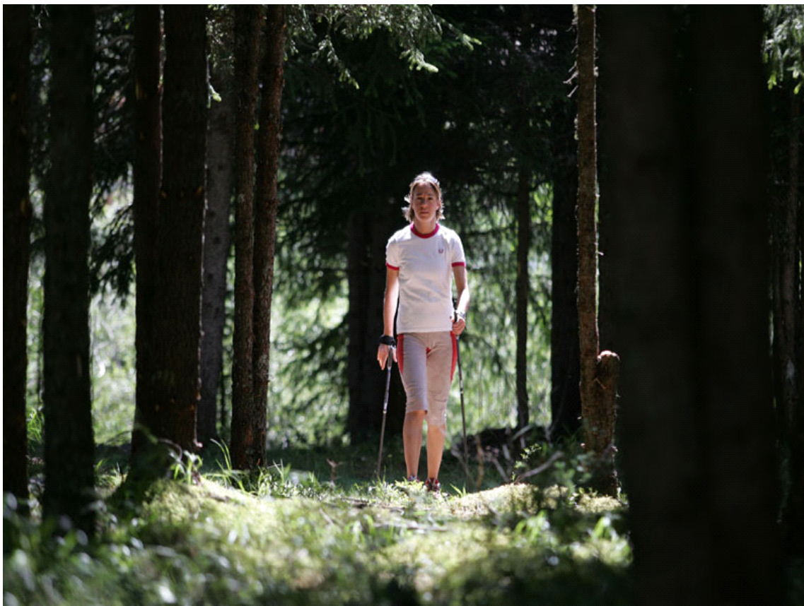
Nordic Walking nei boschi

This publication is for information purposes only. We recommend you consult and check the weather forecast and snow conditions before every excursion.