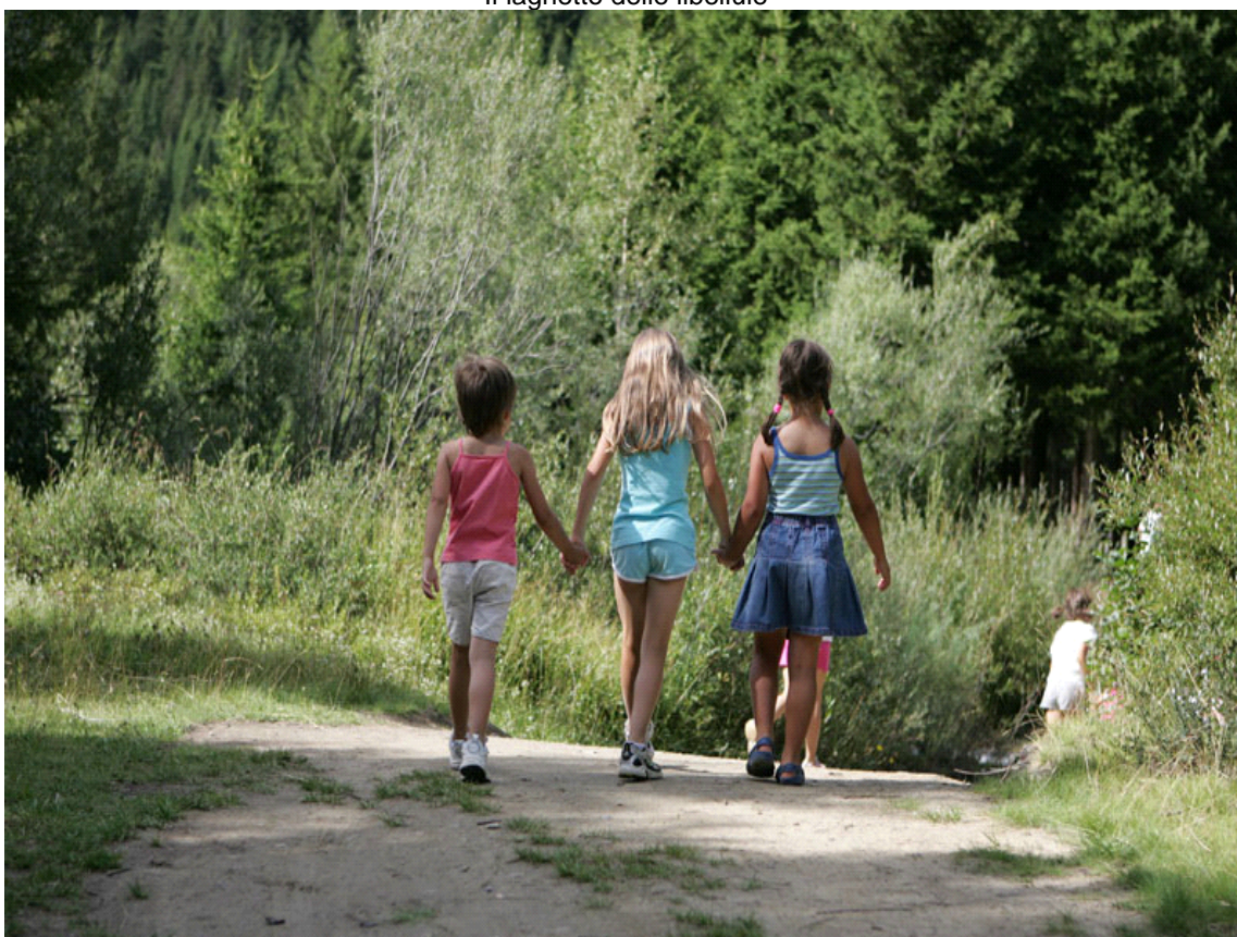
Estate in montagna con i bambini