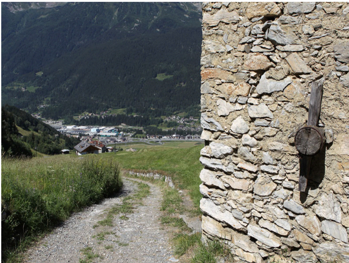
Strada di San Pietro