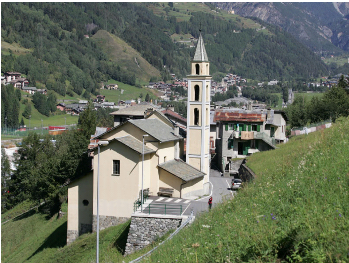
La chiesa di San Giovanni Evangelista a Piatta

This publication is for information purposes only. We recommend you consult and check the weather forecast and snow conditions before every excursion.