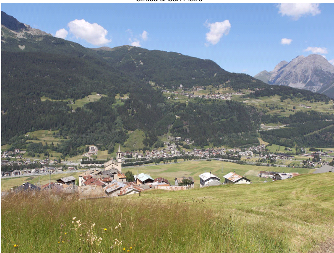
Il paesino di Piatta