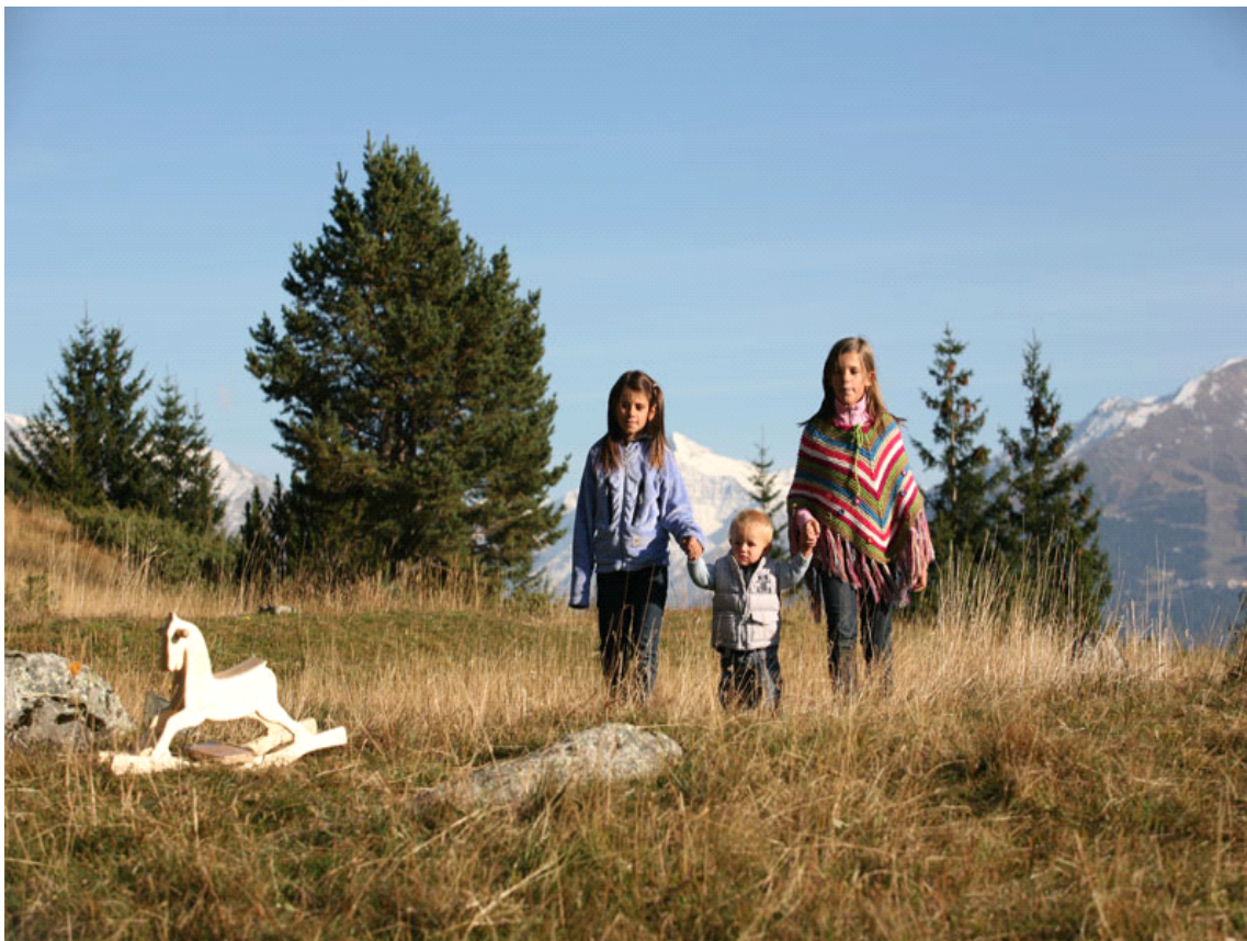
Bimbi a passeggio lungo il percorso di Oga