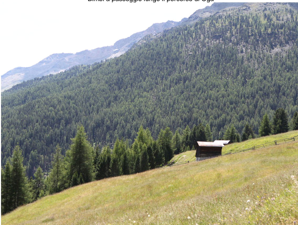
Fitti boschi di montagna