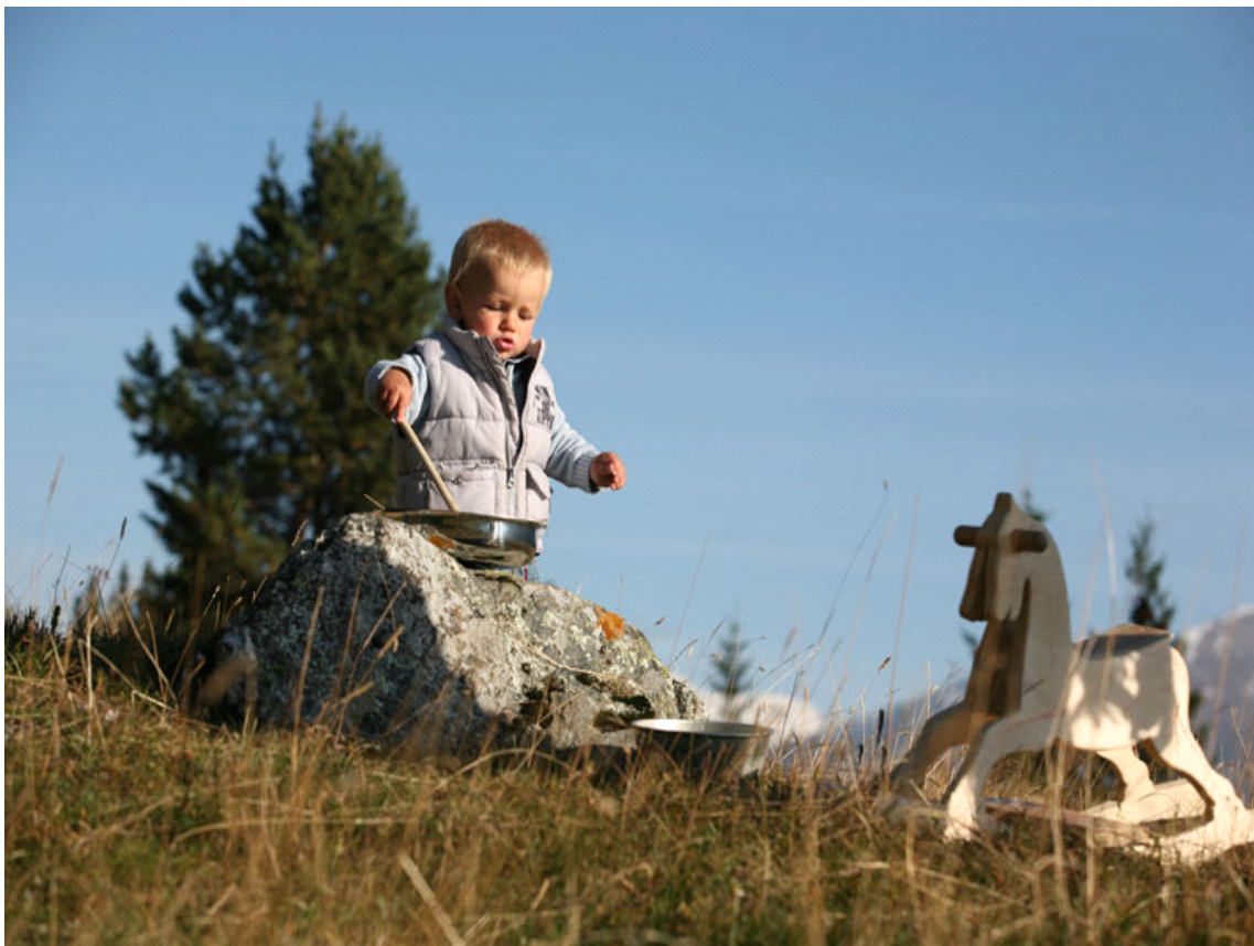
Giochi in montagna

This publication is for information purposes only. We recommend you consult and check the weather forecast and snow conditions before every excursion.