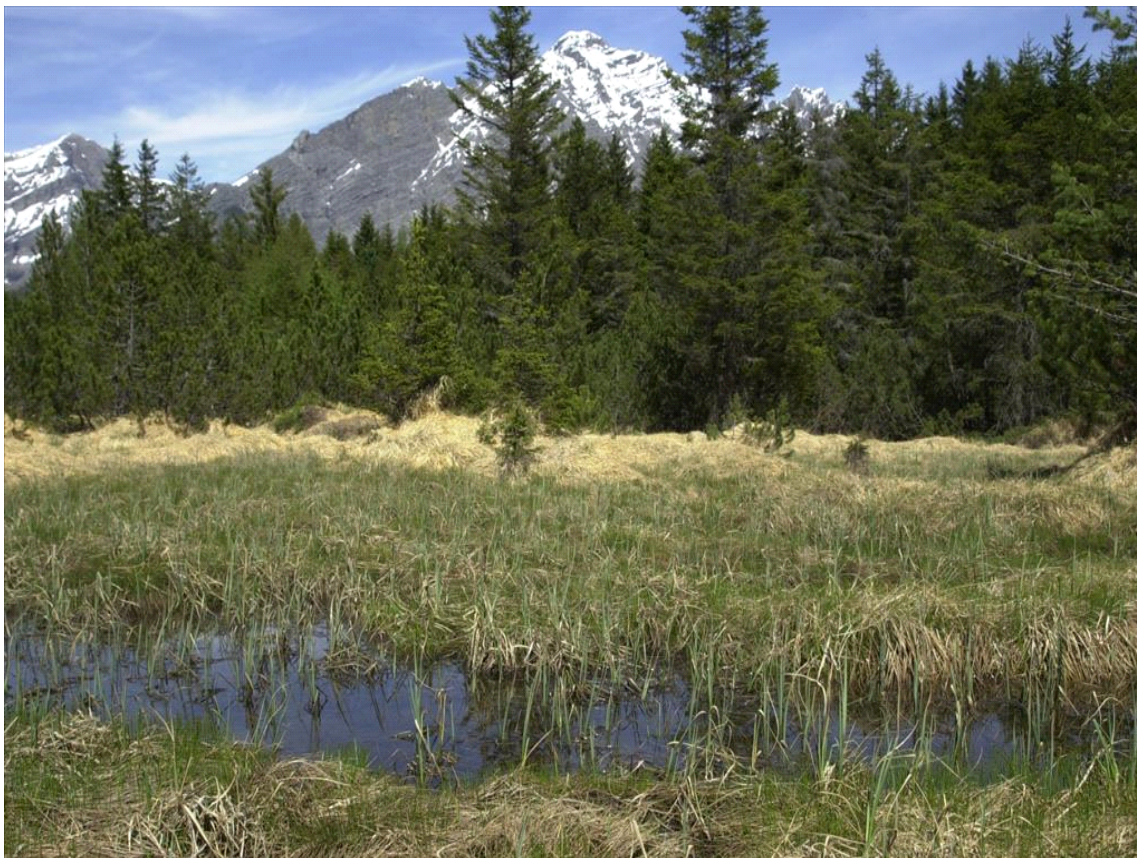
La Riserva del Paluaccio