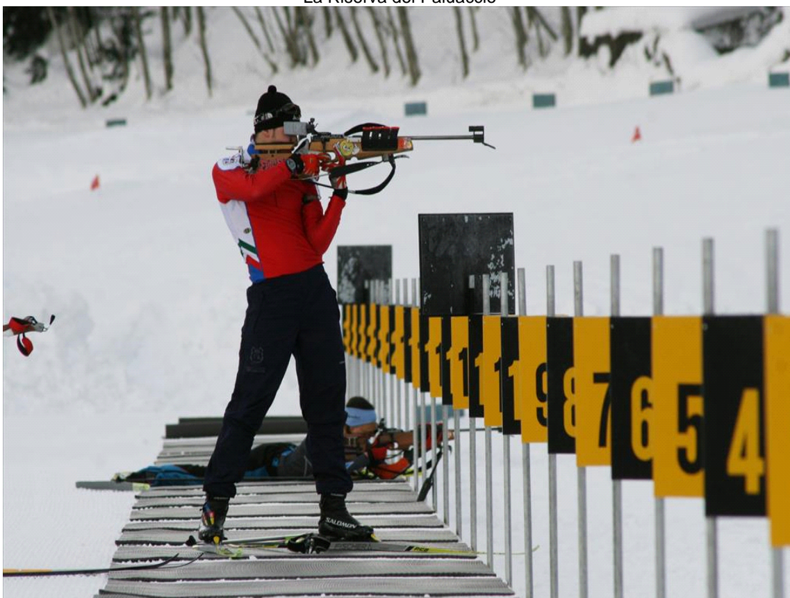
Biathlon in Valdidentro

This publication is for information purposes only. We recommend you consult and check the weather forecast and snow conditions before every excursion.