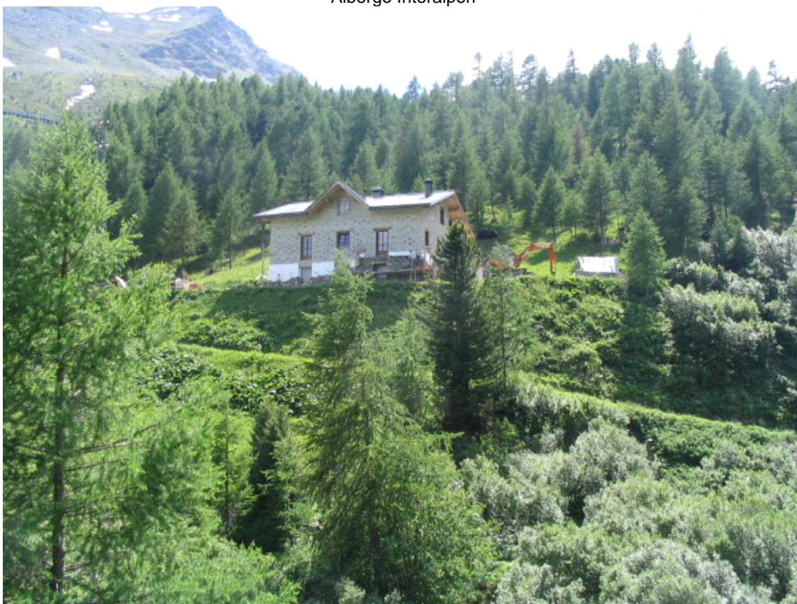
Valle del Foscagno

This publication is for information purposes only. We recommend you consult and check the weather forecast and snow conditions before every excursion.