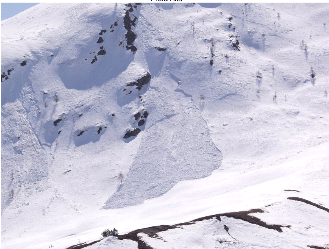
Valanghe nella storia

This publication is for information purposes only. We recommend you consult and check the weather forecast and snow conditions before every excursion.