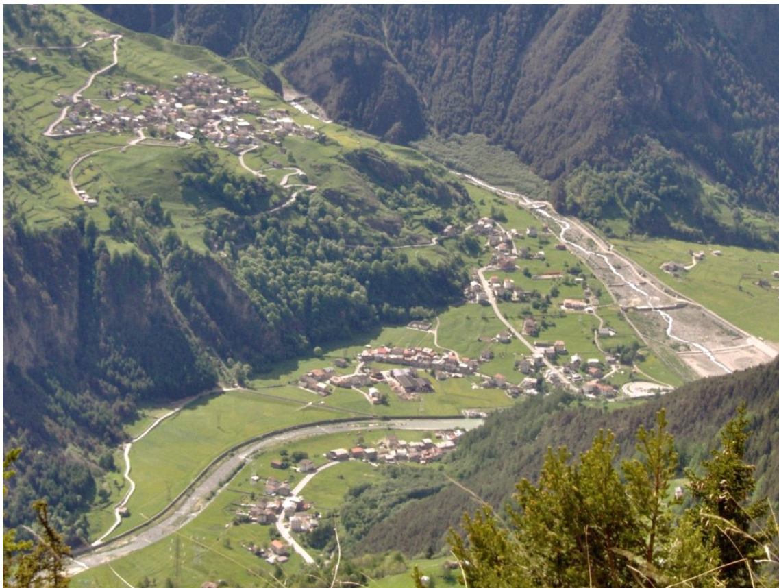
Ca di Calvi