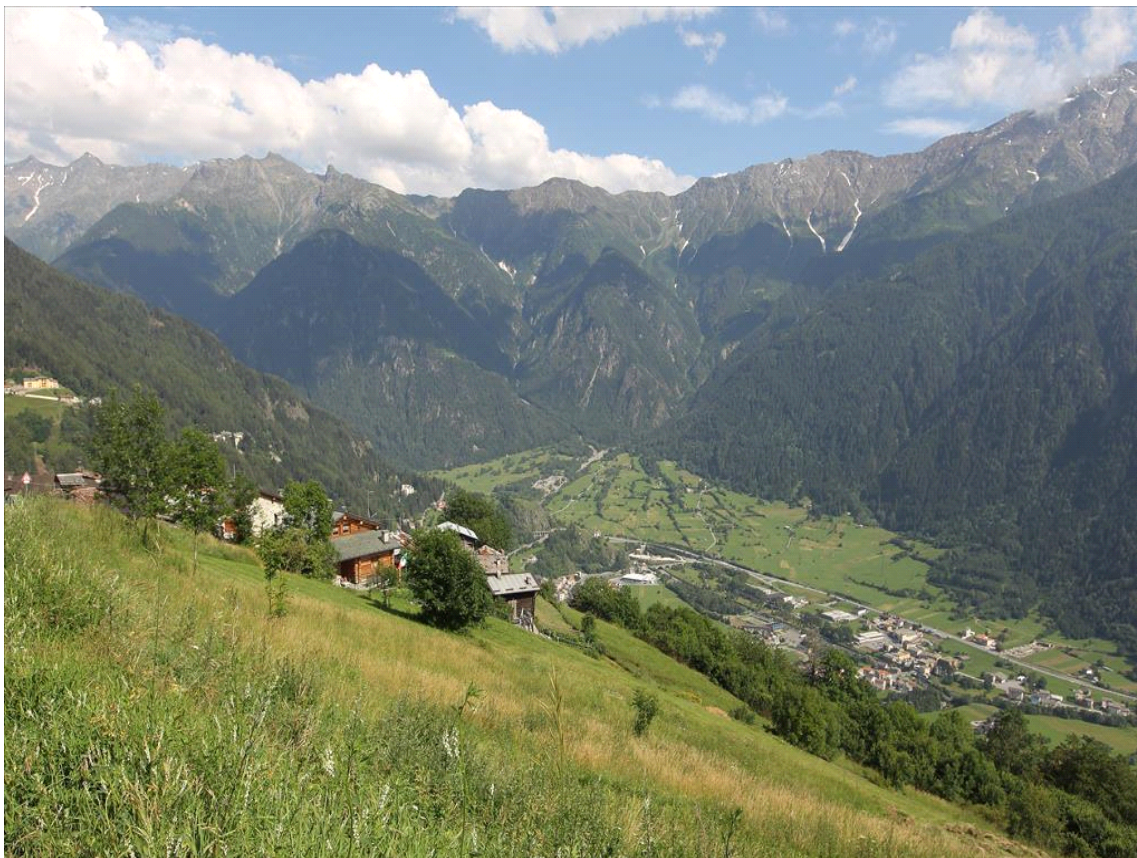
Madonna della Neve