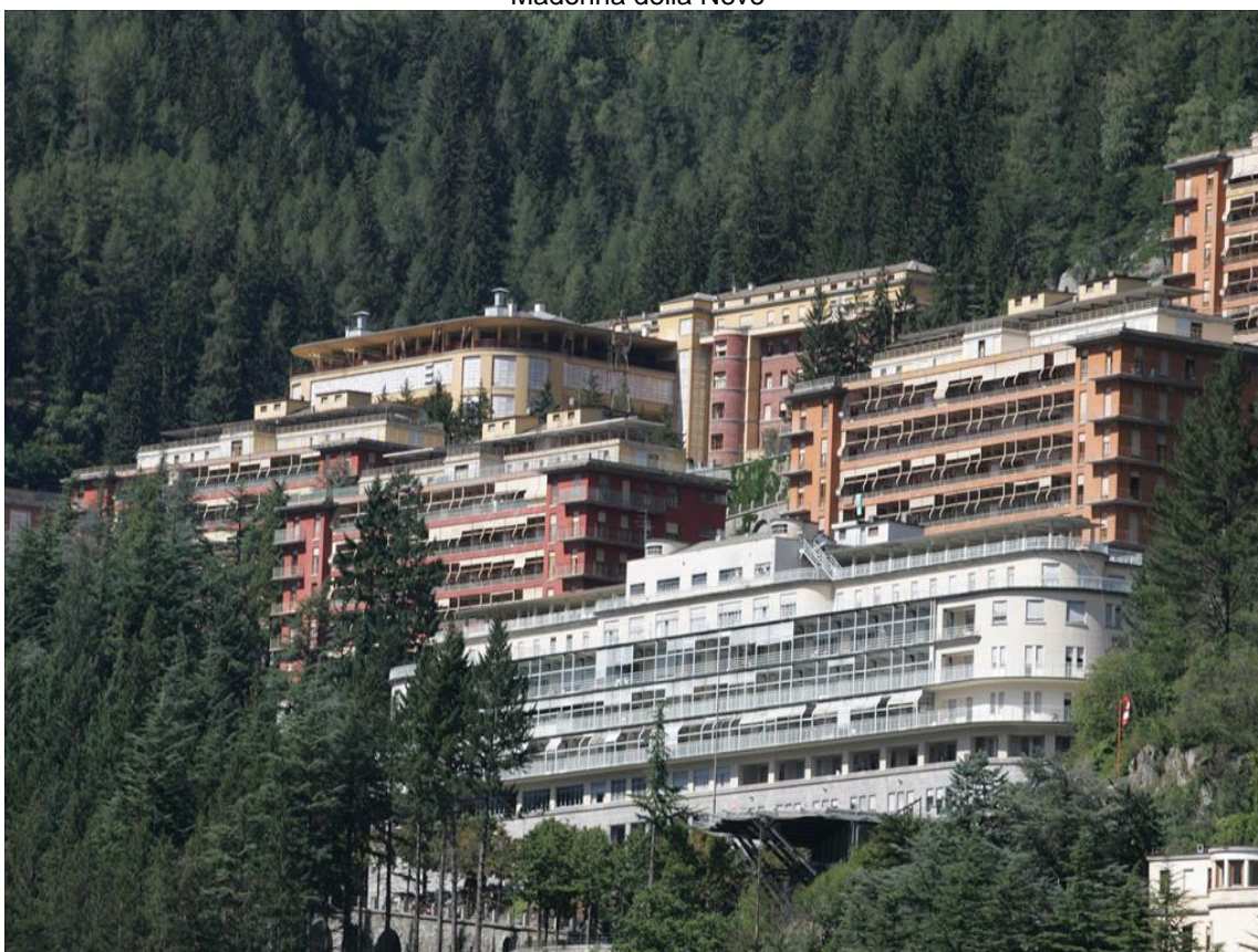
Ospedale Morelli di Sondalo

This publication is for information purposes only. We recommend you consult and check the weather forecast and snow conditions before every excursion.