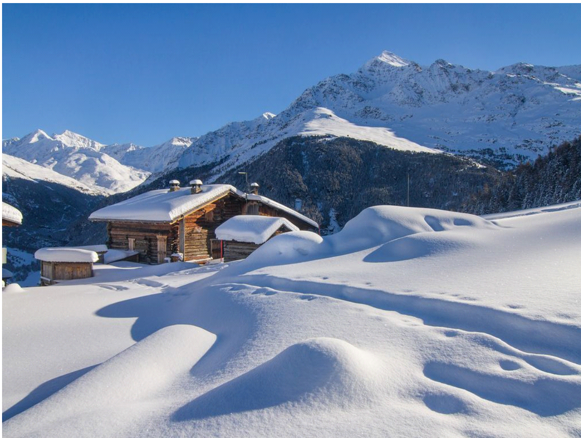
Baite di Plaghera

This publication is for information purposes only. We recommend you consult and check the weather forecast and snow conditions before every excursion.