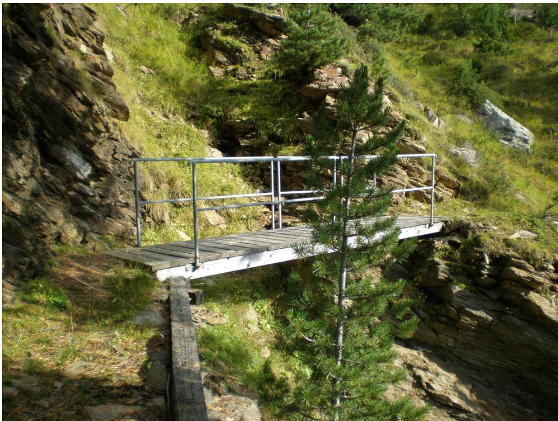
Verso il Pian delle Marmotte