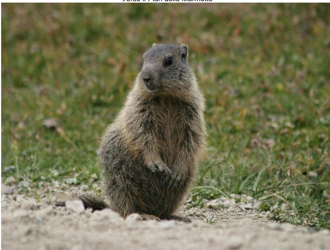
La marmotta alpina

This publication is for information purposes only. We recommend you consult and check the weather forecast and snow conditions before every excursion.