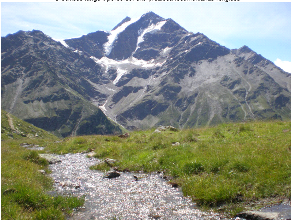
Il ghiacciaio dei Forni