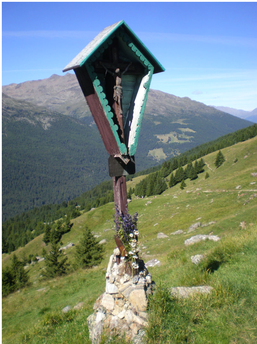
Crocifisso lungo il percorso: una preziosa testimonianza religiosa