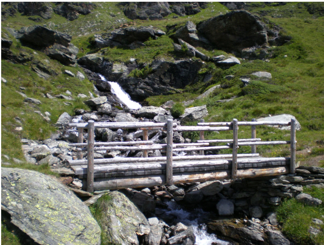
Ruscelli di acqua limpida corrono lungo i pascoli

This publication is for information purposes only. We recommend you consult and check the weather forecast and snow conditions before every excursion.