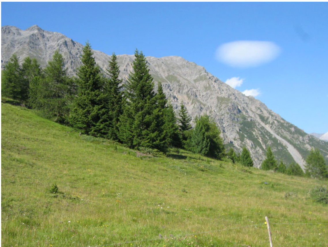
Lungo i prati, verso le torri di Fraele