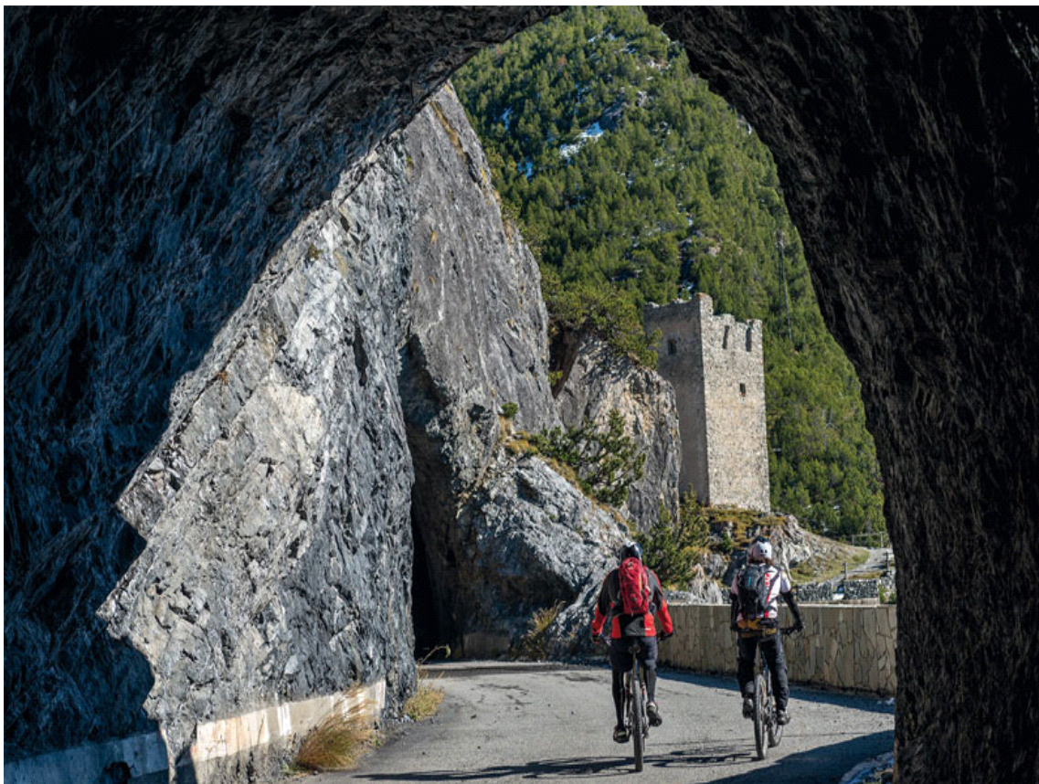
Torri di Fraele