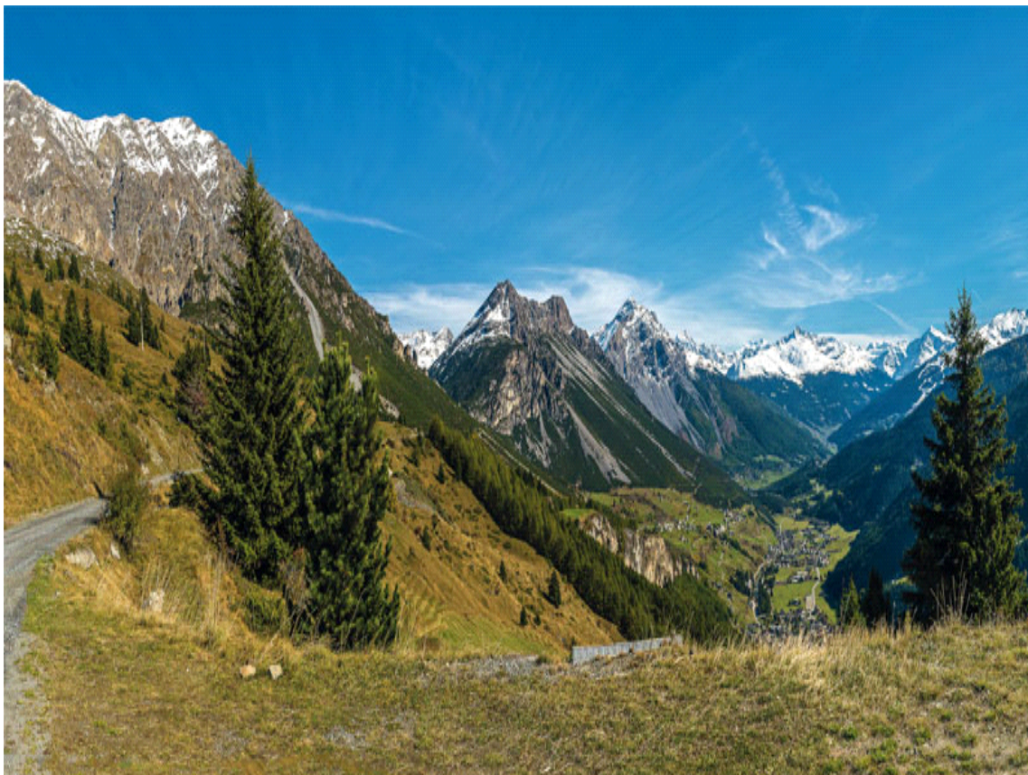
Panorama verso Cancano

This publication is for information purposes only. We recommend you consult and check the weather forecast and snow conditions before every excursion.