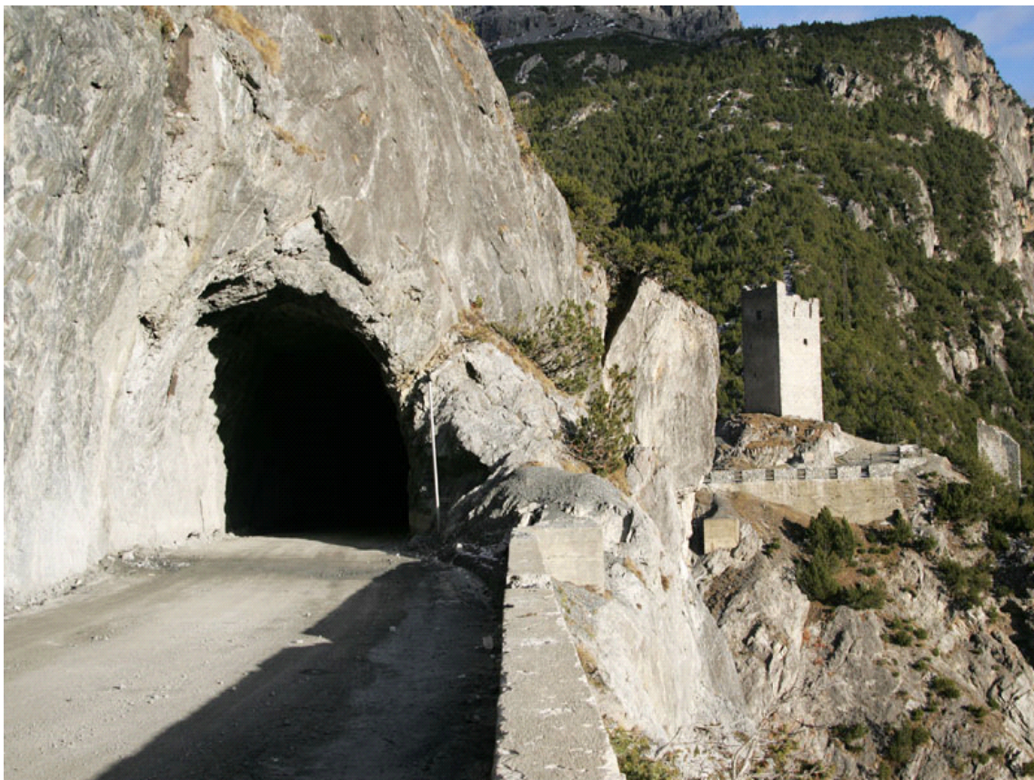
La galleria prima di giungere alle Torri di Fraele