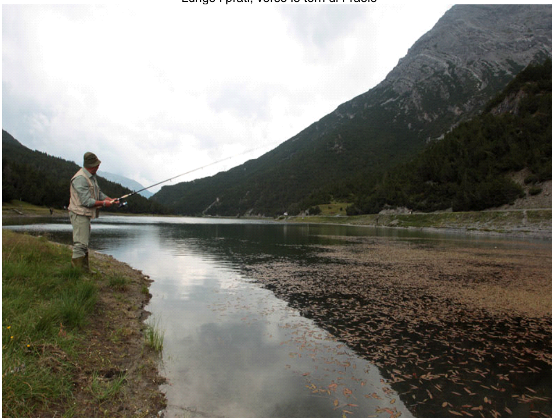
A pesca ai laghi di Cancano