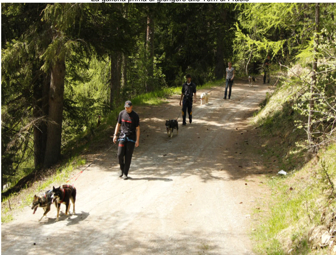
A passeggio sulla Decauville con i cani husky