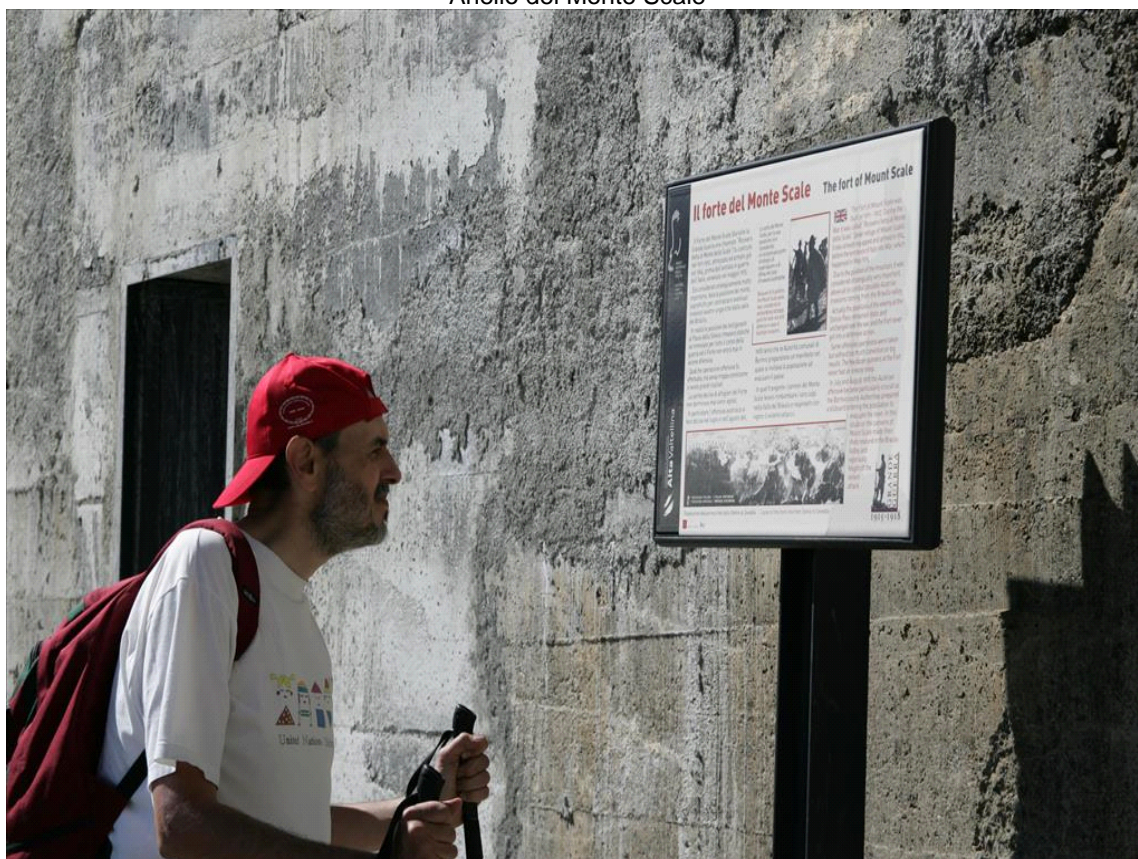
Caserma del Monte Scale