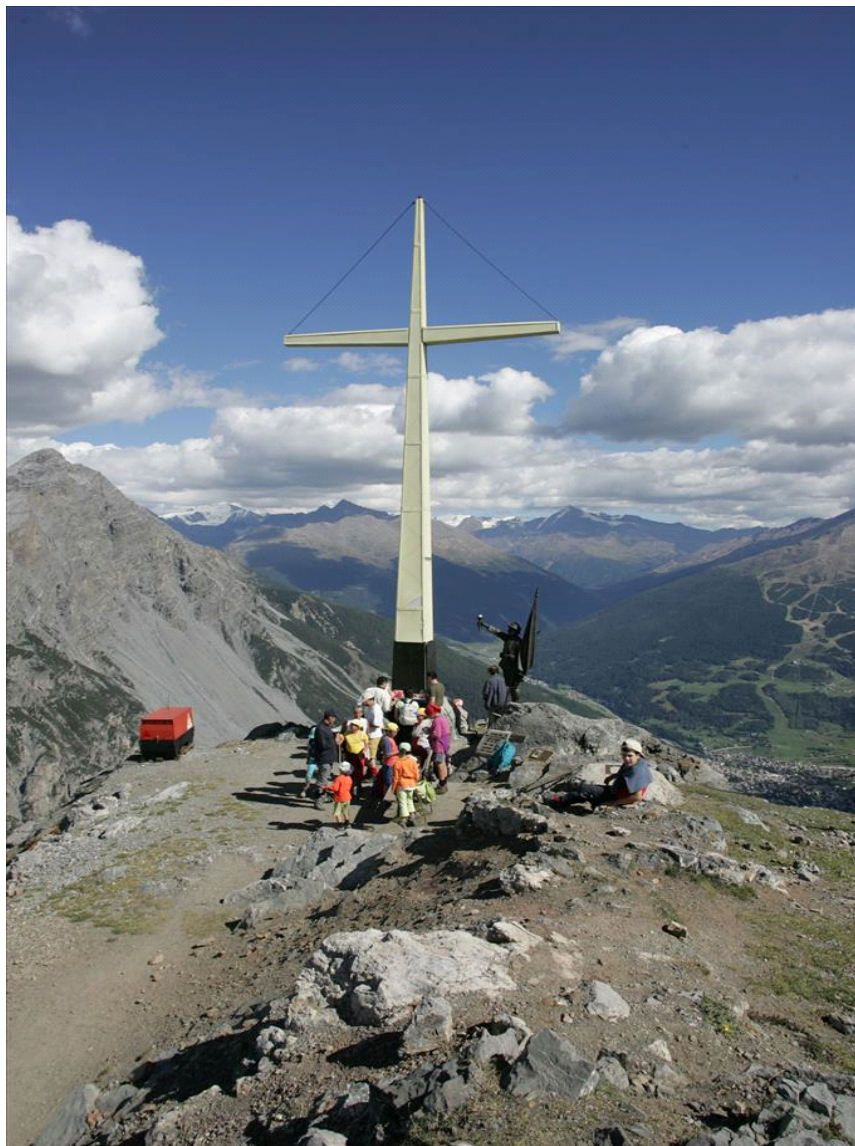
Anello del Monte Scale