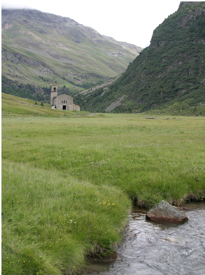
La chiesa di San Bernardo, nella Val di Rezzalo