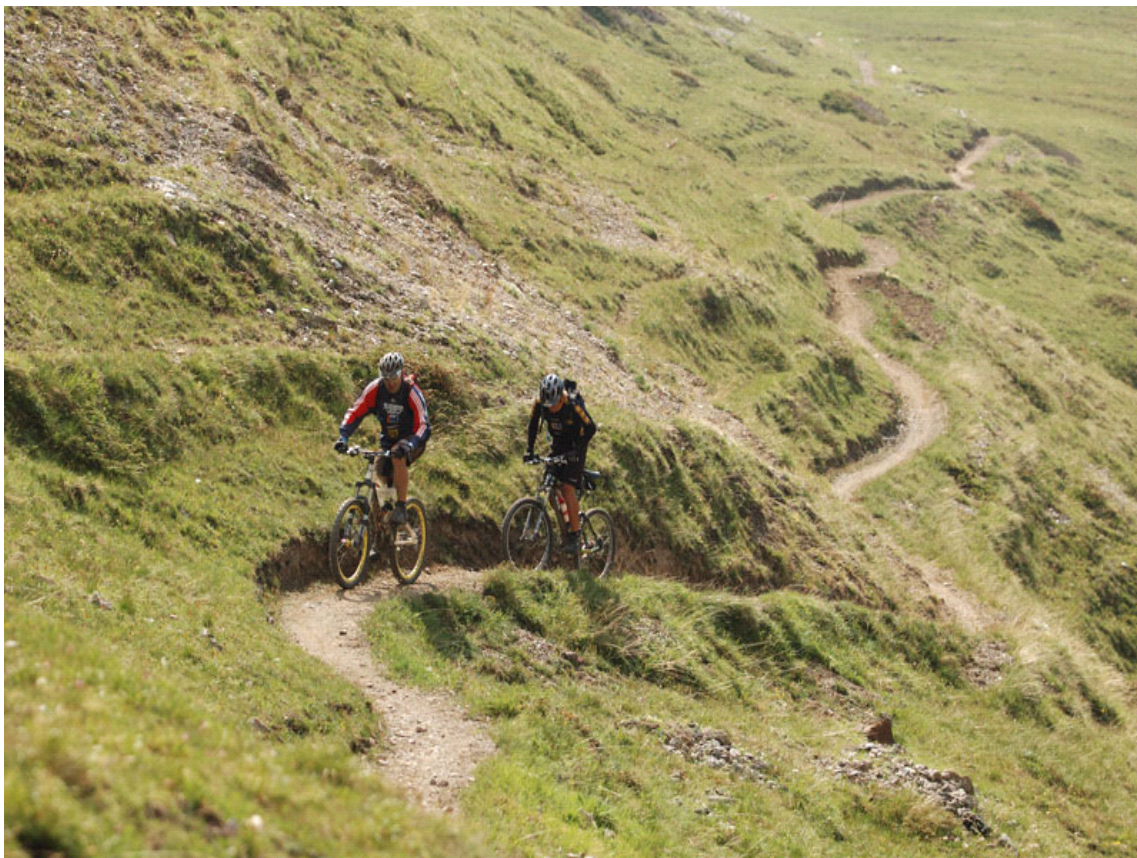
Scendendo lungo il percorso tra i pascoli

This publication is for information purposes only. We recommend you consult and check the weather forecast and snow conditions before every excursion.