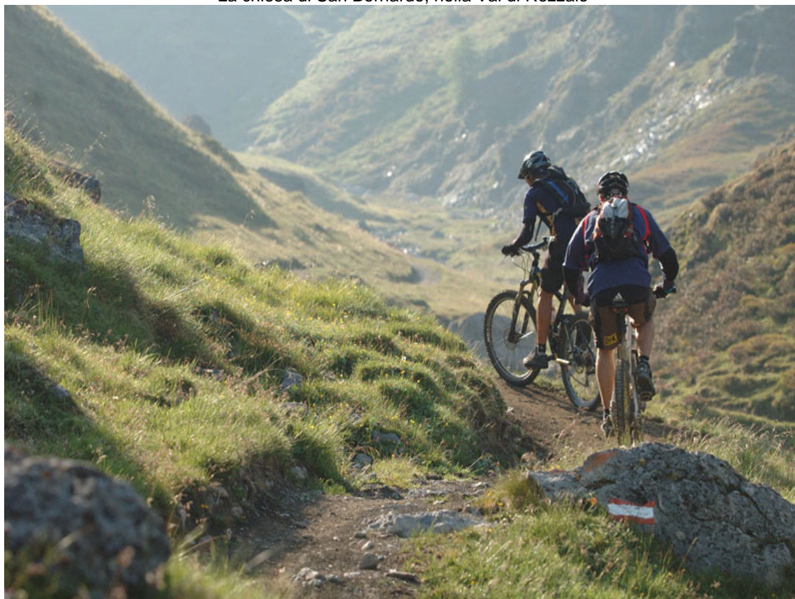
Il sentiero lungo il percorso