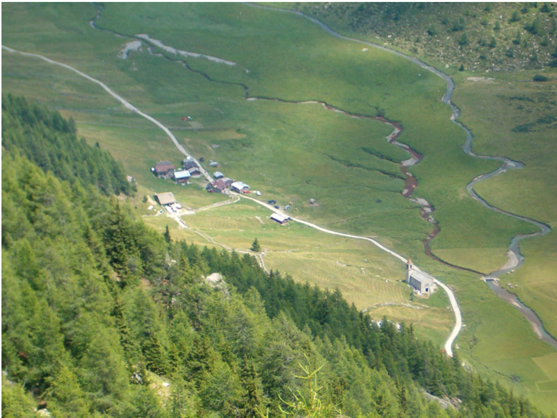
Vista della valle sottostante