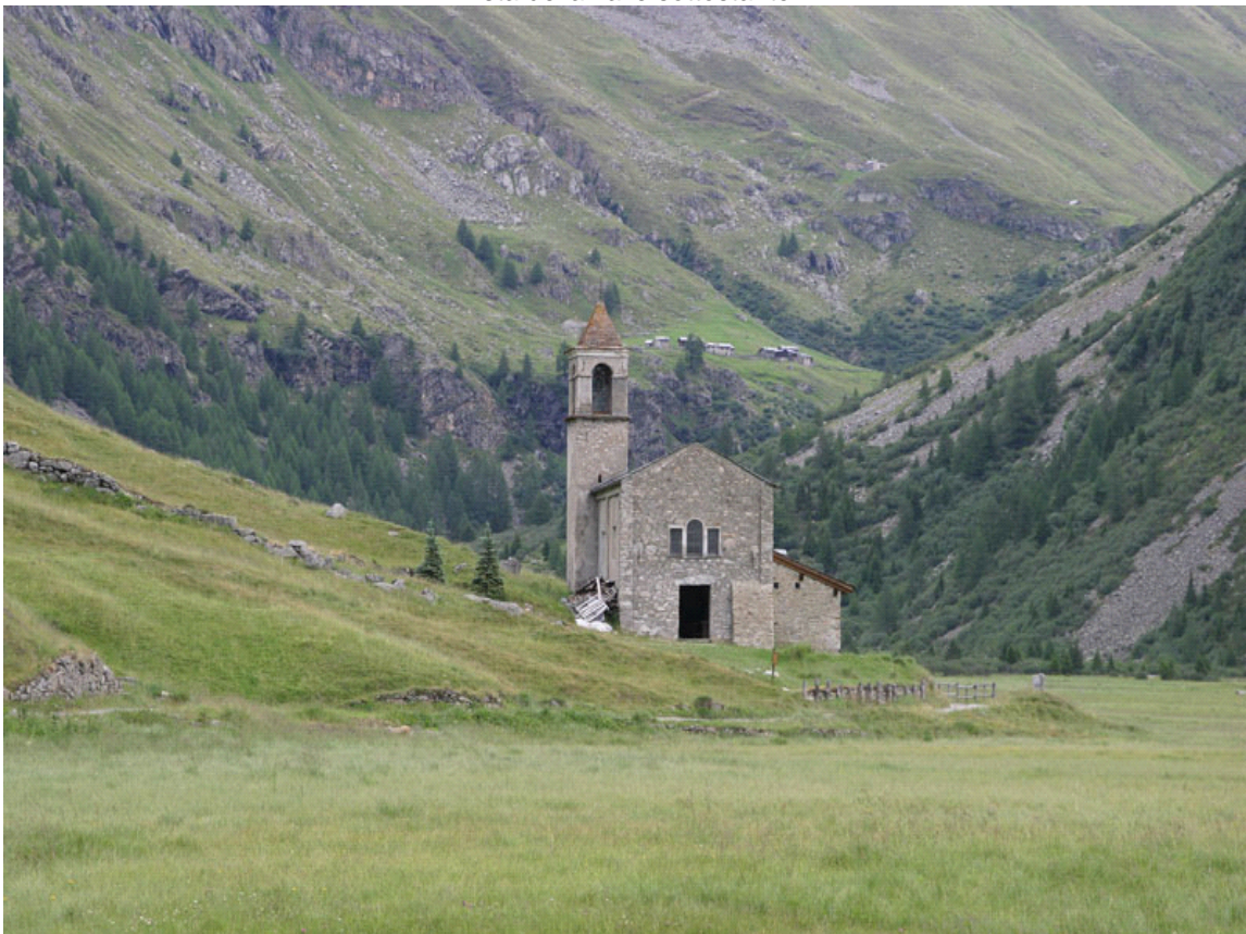
La chiesa nella piana di San Bernard

This publication is for information purposes only. We recommend you consult and check the weather forecast and snow conditions before every excursion.