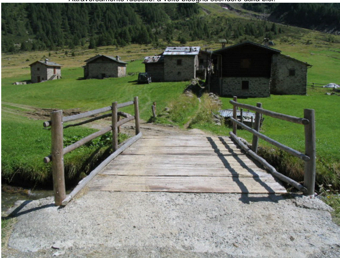
I tipici ponticelli di montagna, in legno