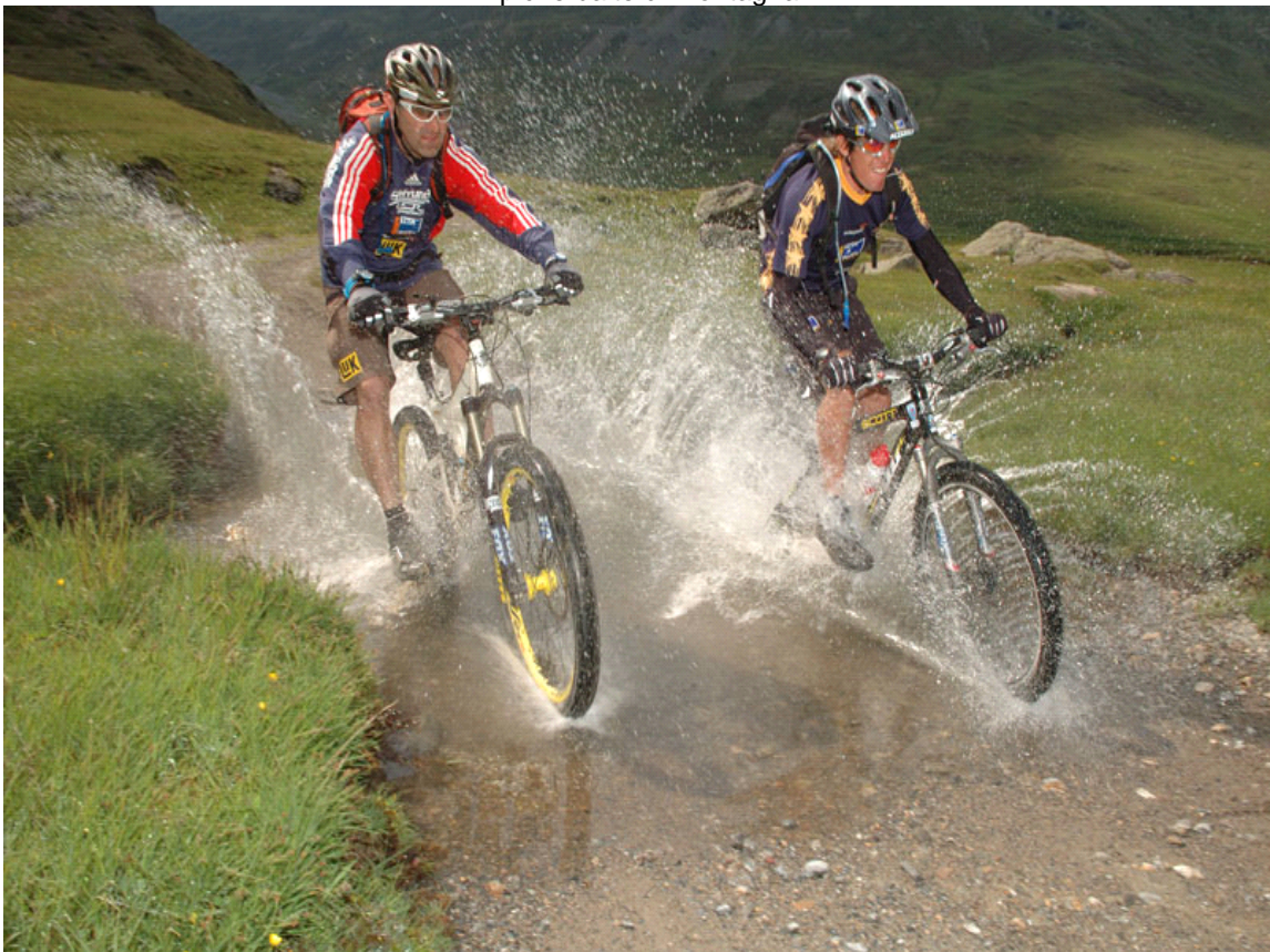
In mountain bike verso la piana di San Bernard