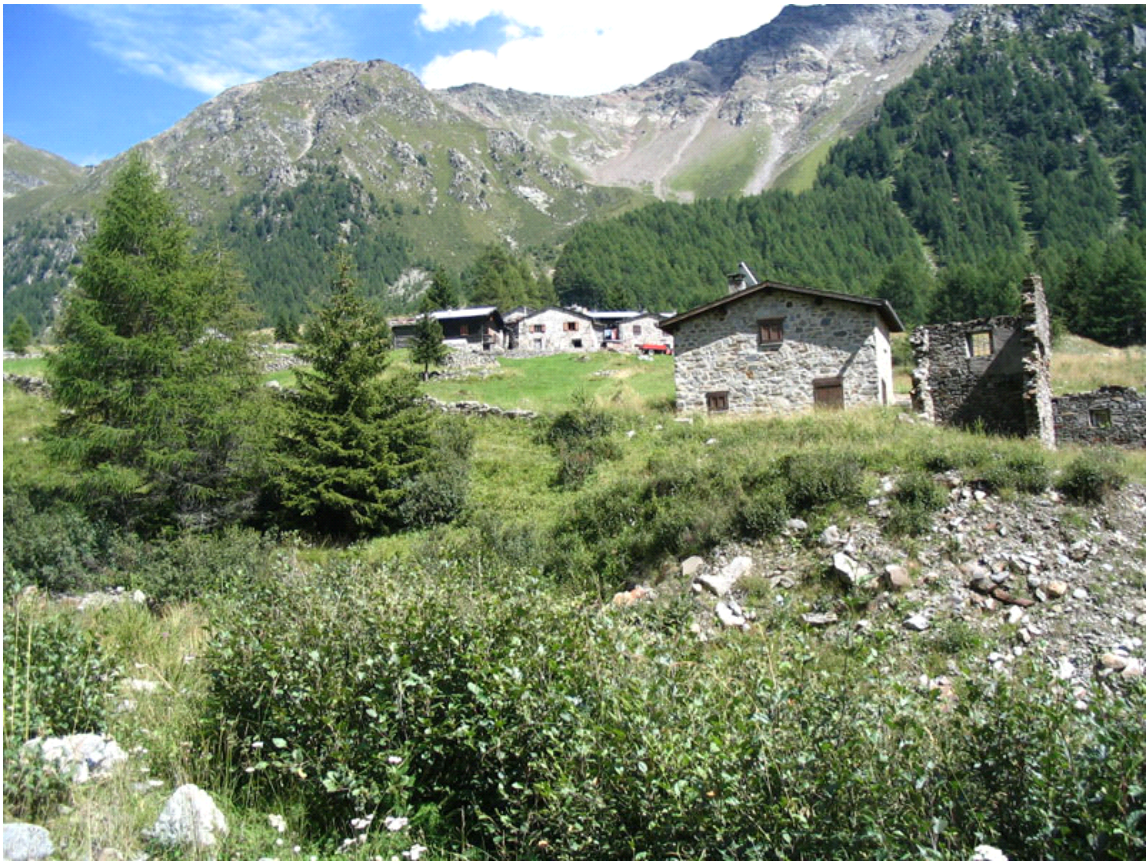
Tipiche baite di montagna