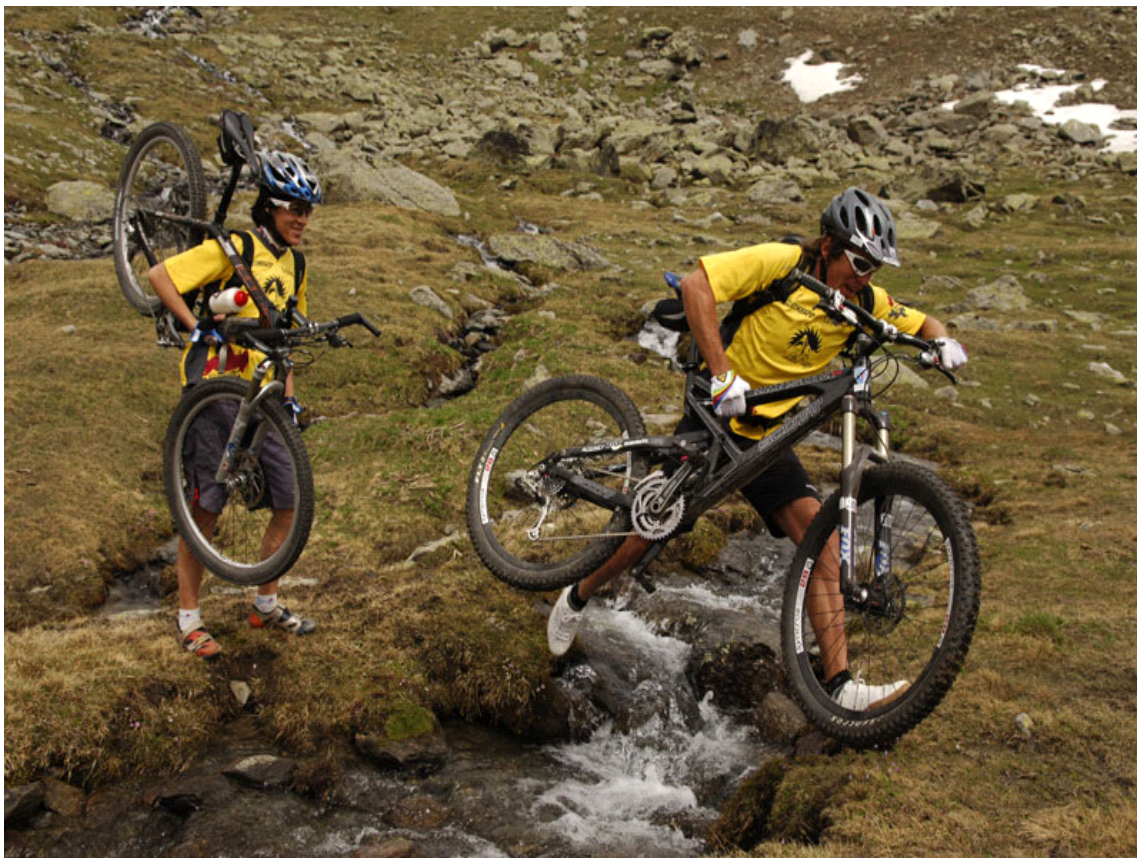
Attraversamento ruscello: a volte bisogna scendere dalla bici!