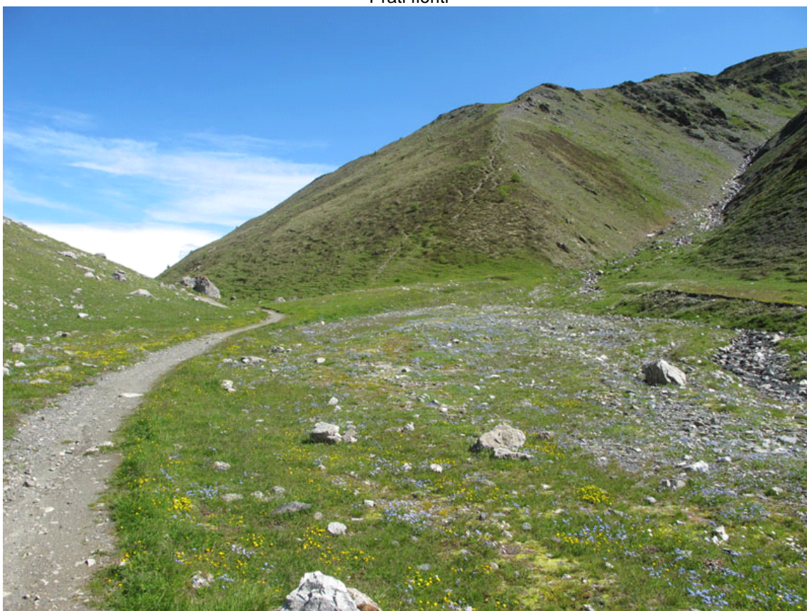
Il percorso Bochéta de Trèla