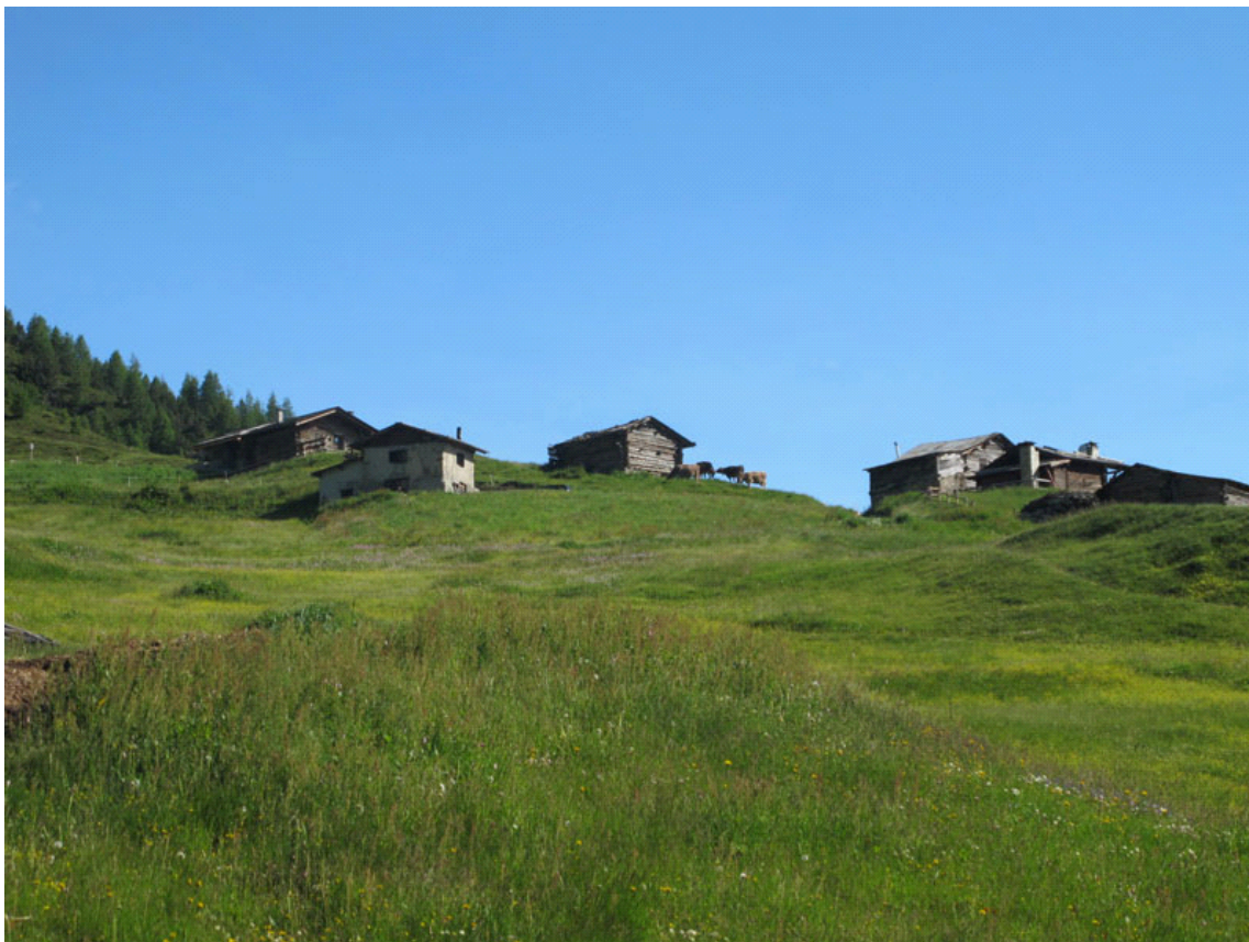
Le Tee de Pila

This publication is for information purposes only. We recommend you consult and check the weather forecast and snow conditions before every excursion.