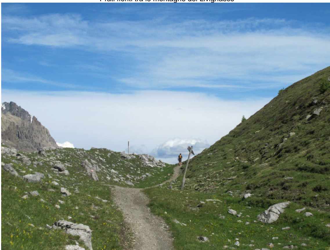
Il percorso Bochéta de Trèla