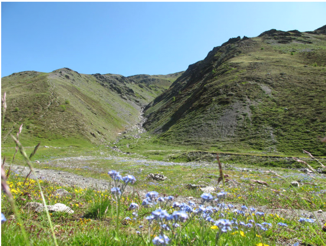
Prati fioriti tra le montagne del Livignasco