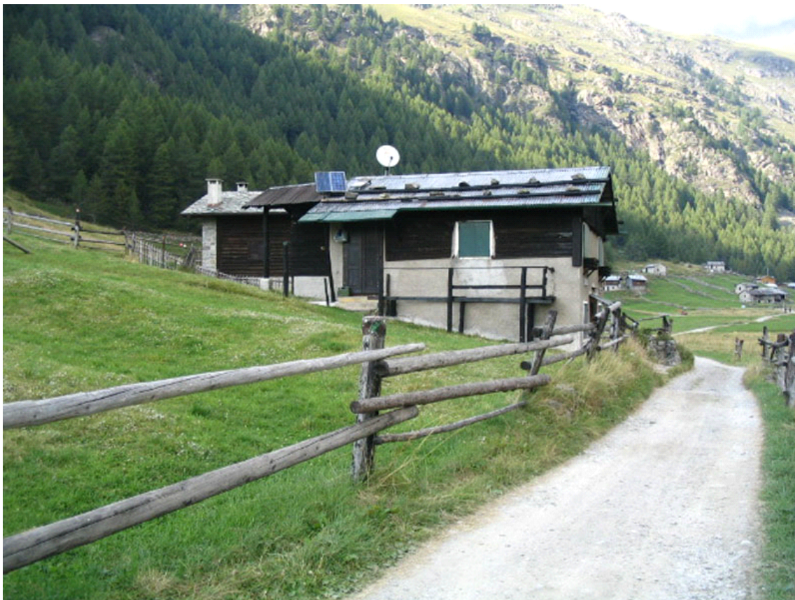
Il percorso Valle di Rezzalo su strada sterrata