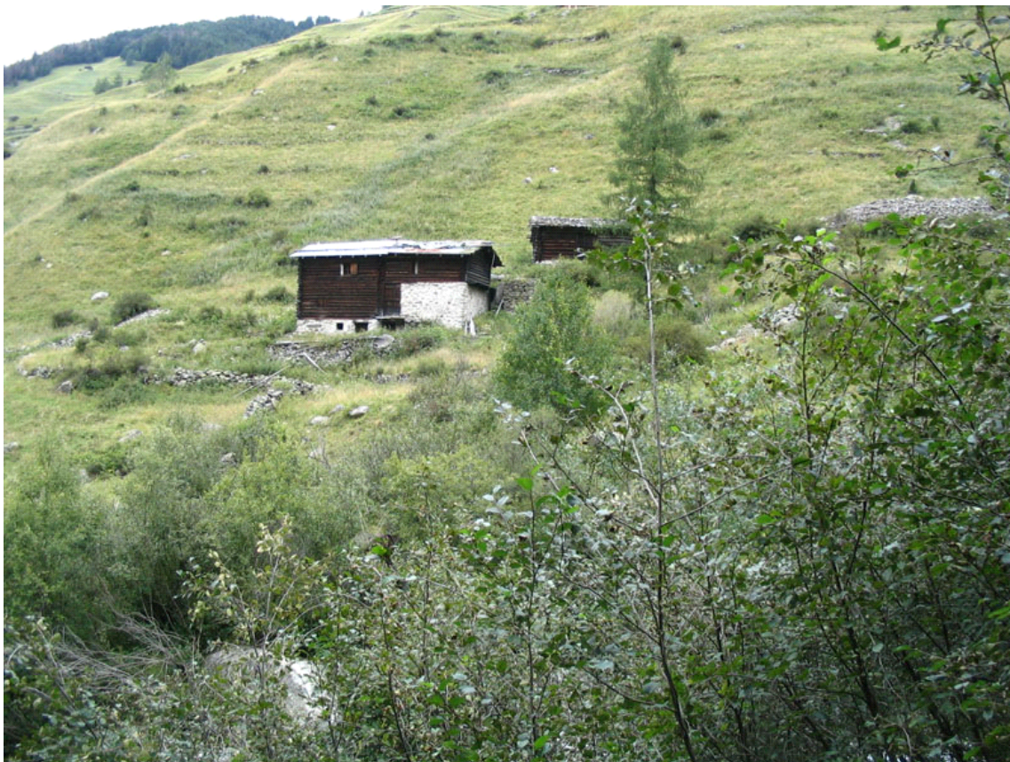
I pascoli lungo il percorso Valle di Rezzalo