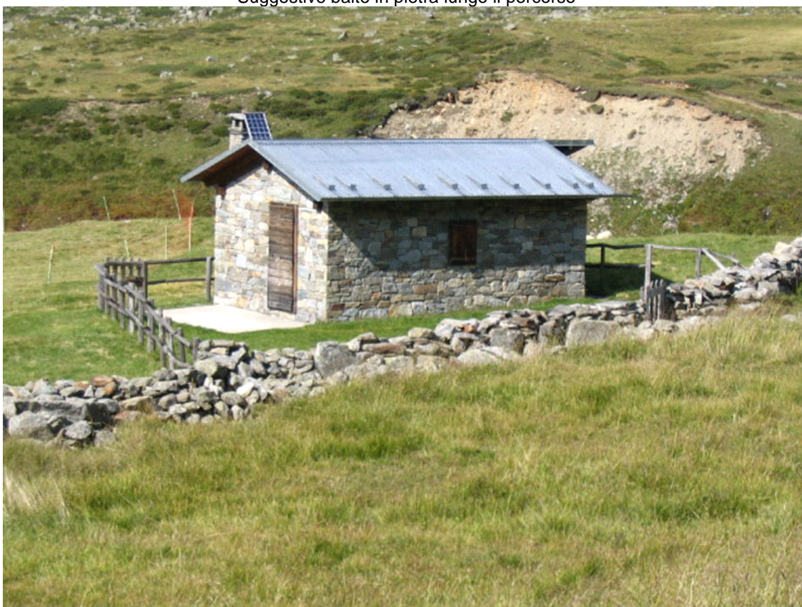
Tipica baitina in pietra e sasso

This publication is for information purposes only. We recommend you consult and check the weather forecast and snow conditions before every excursion.