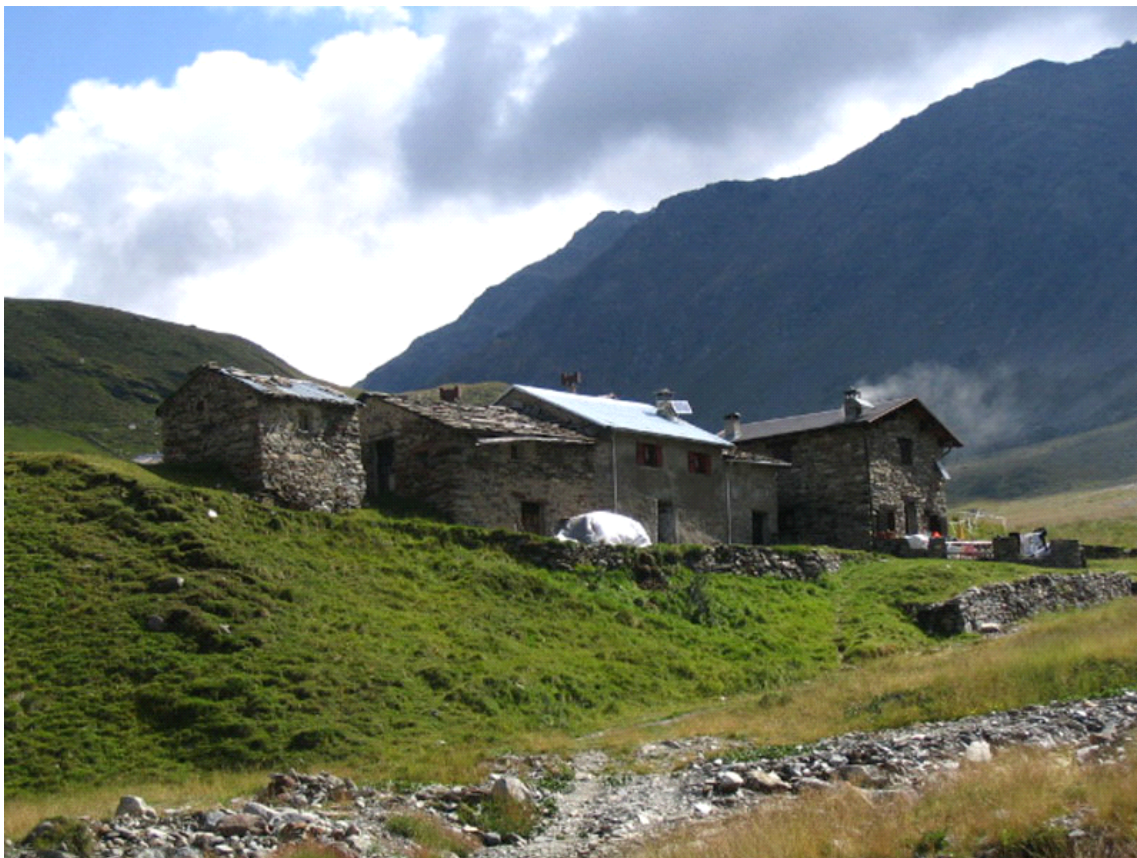
Suggestive baite in pietra lungo il percorso