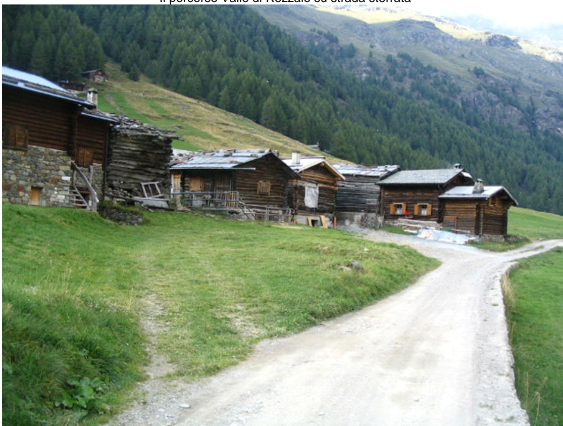
Le tipiche baite in pietra e legno