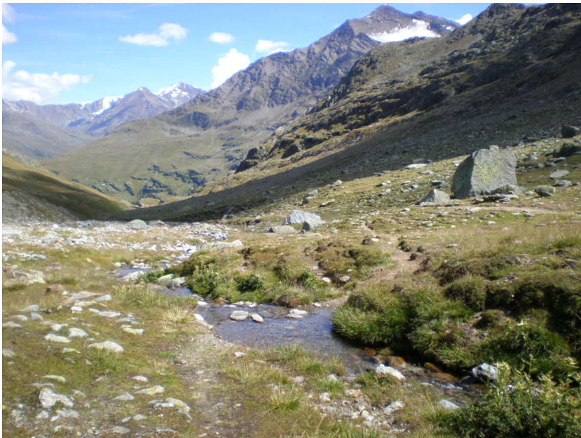
Uno scorcio del percorso Valle di Rezzalo