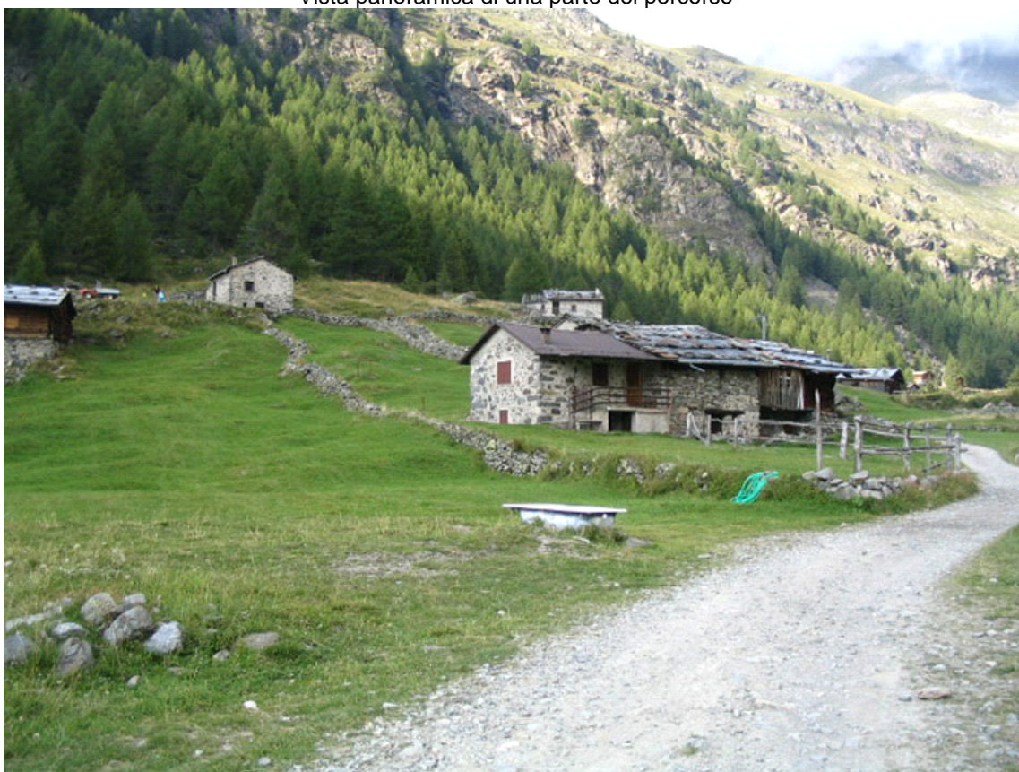
Baite in legno e pietra