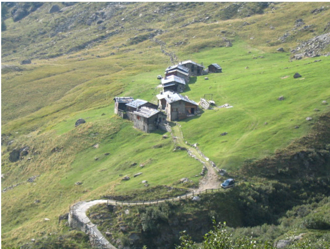
Vista panoramica di una parte del percorso