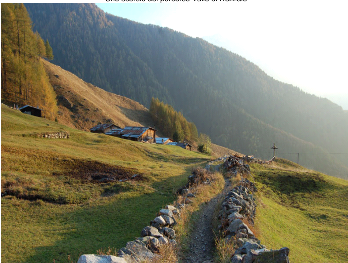
Tramonto sui pascoli