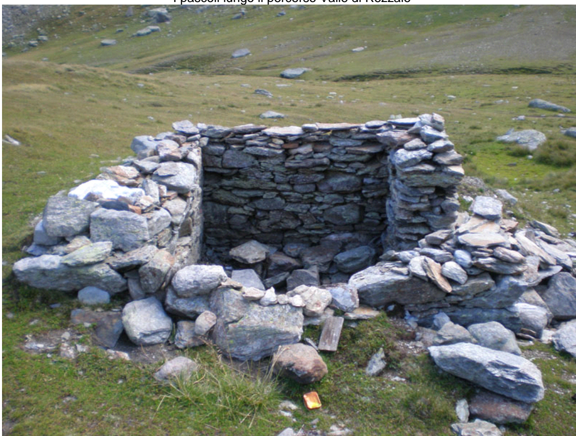
In questa zona sono stati scoperti insediamenti risalenti al mesolitico