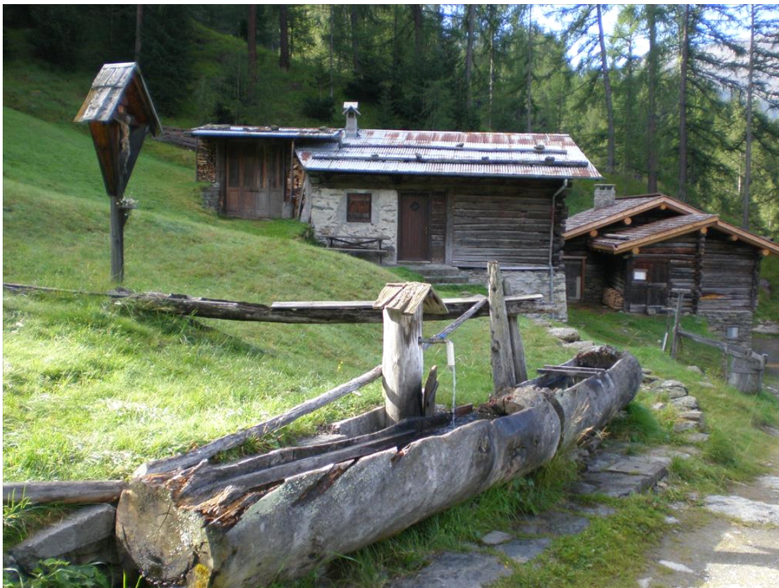
Panoramica su Valfurva