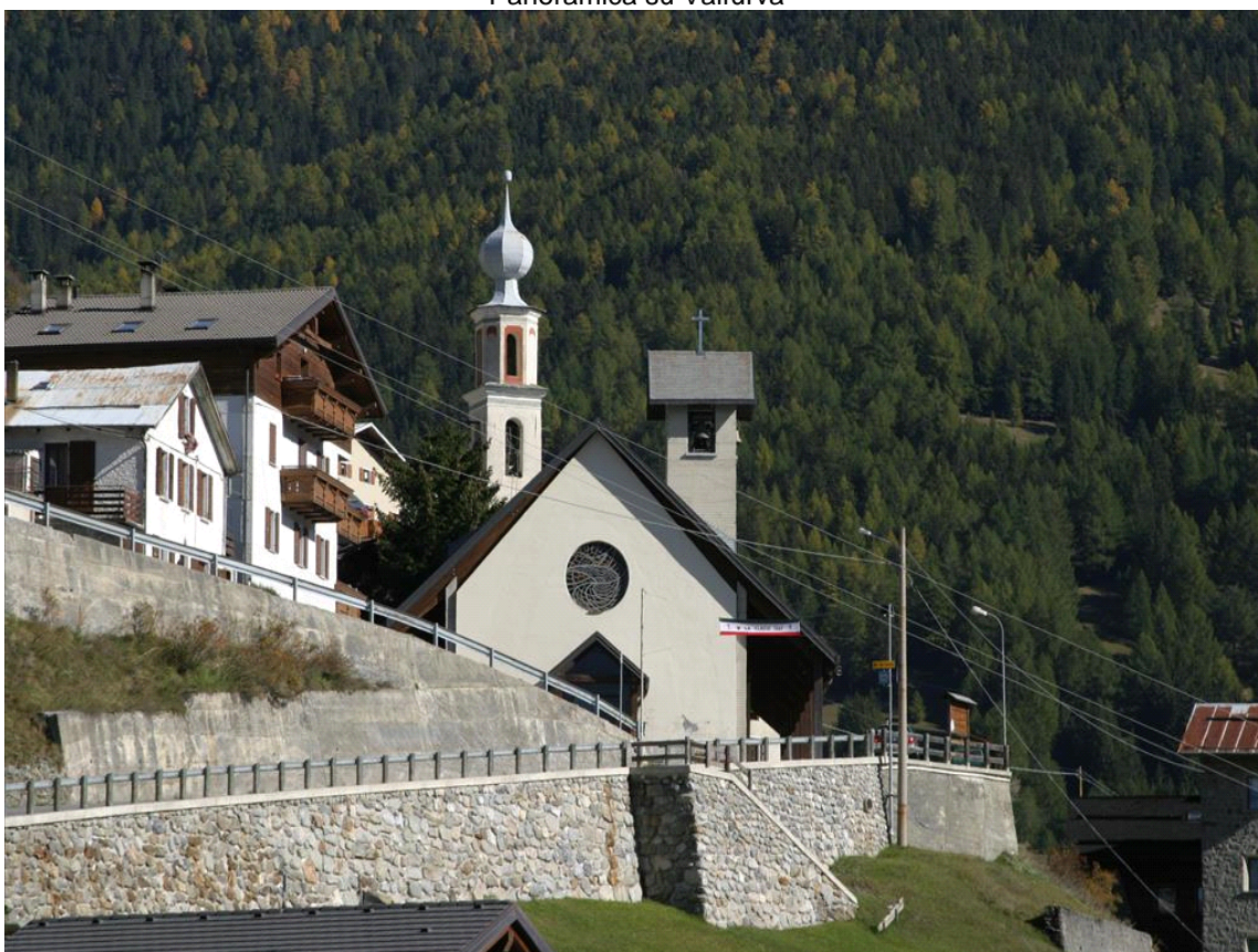
Chiesa di Madonna dei Monti

This publication is for information purposes only. We recommend you consult and check the weather forecast and snow conditions before every excursion.