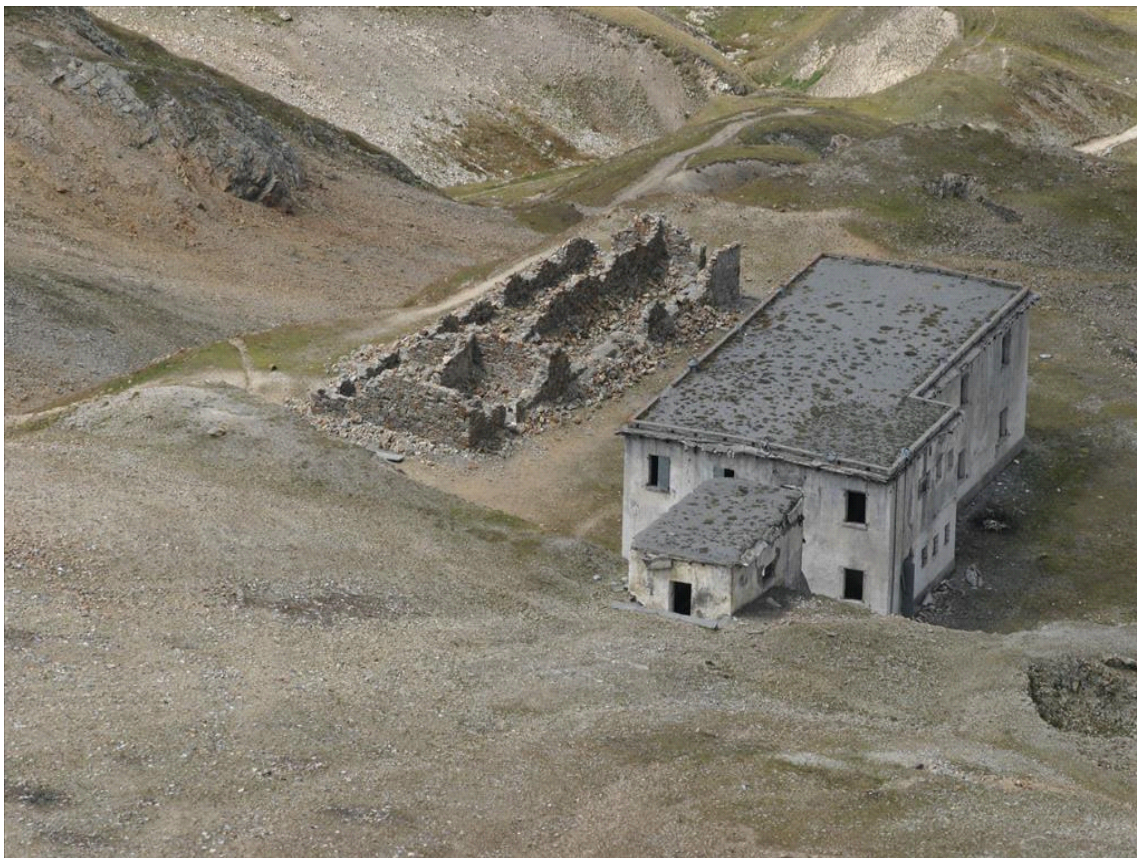
Piz Umbrail e Punta di Rims