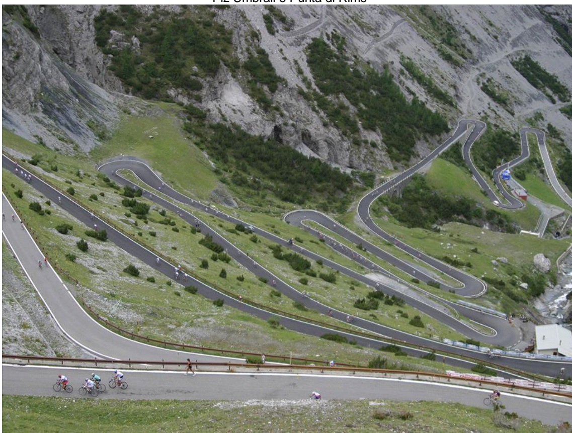
Strada dello Stelvio

This publication is for information purposes only. We recommend you consult and check the weather forecast and snow conditions before every excursion.