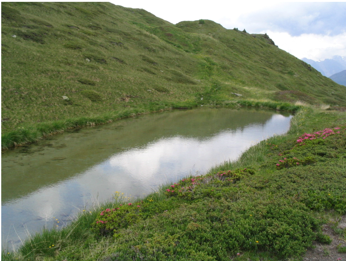
Panoramica sulla Val Viola