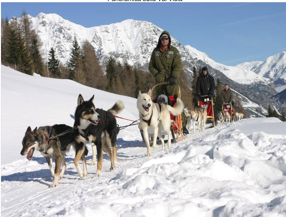
Sleddog in Alta Valtellina

This publication is for information purposes only. We recommend you consult and check the weather forecast and snow conditions before every excursion.