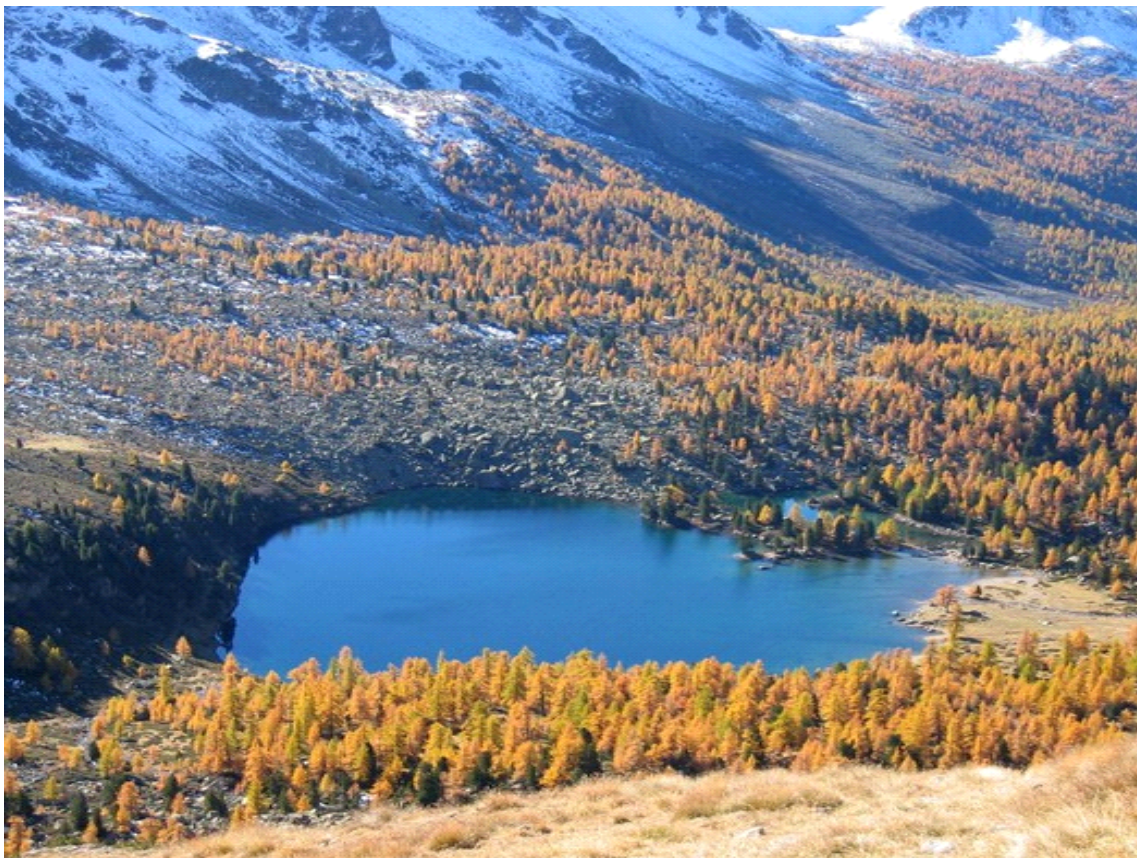
Laghetto in Val Viola

This publication is for information purposes only. We recommend you consult and check the weather forecast and snow conditions before every excursion.