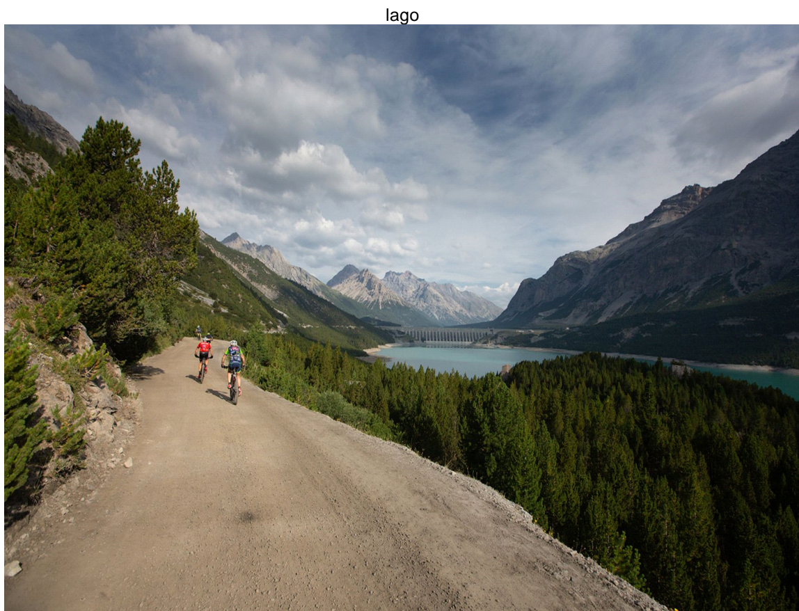
terra e cielo