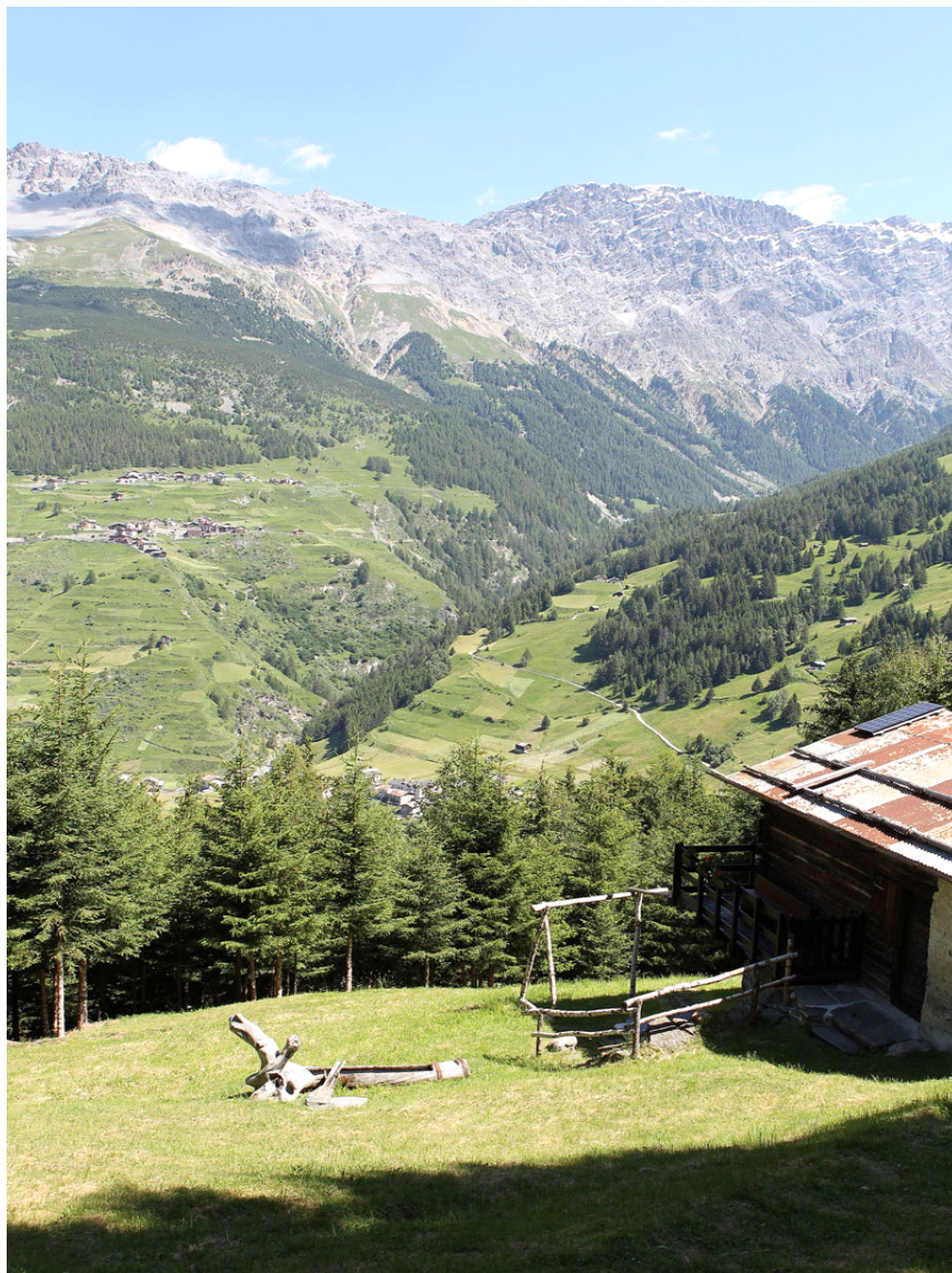
Una meravigliosa panoramica dalla Valle di Calvarana