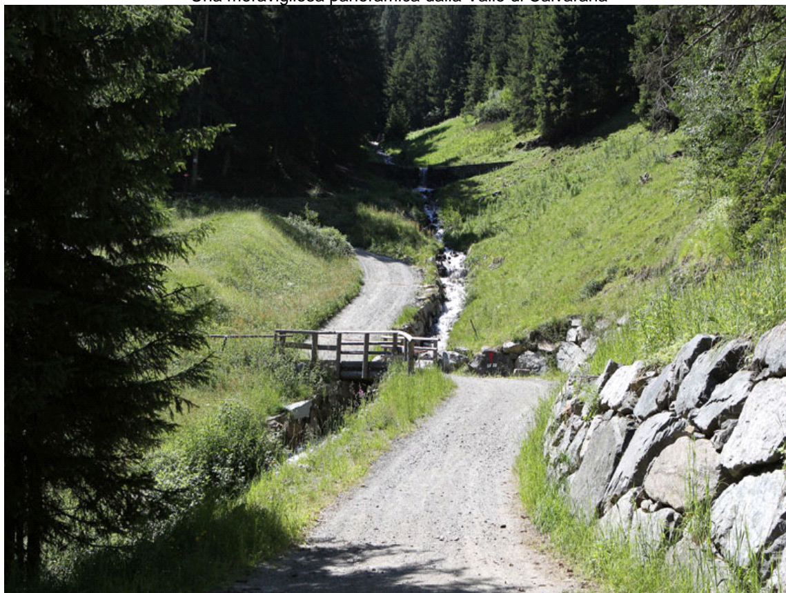
I tipici ponticelli di montagna, lungo i ruscelli