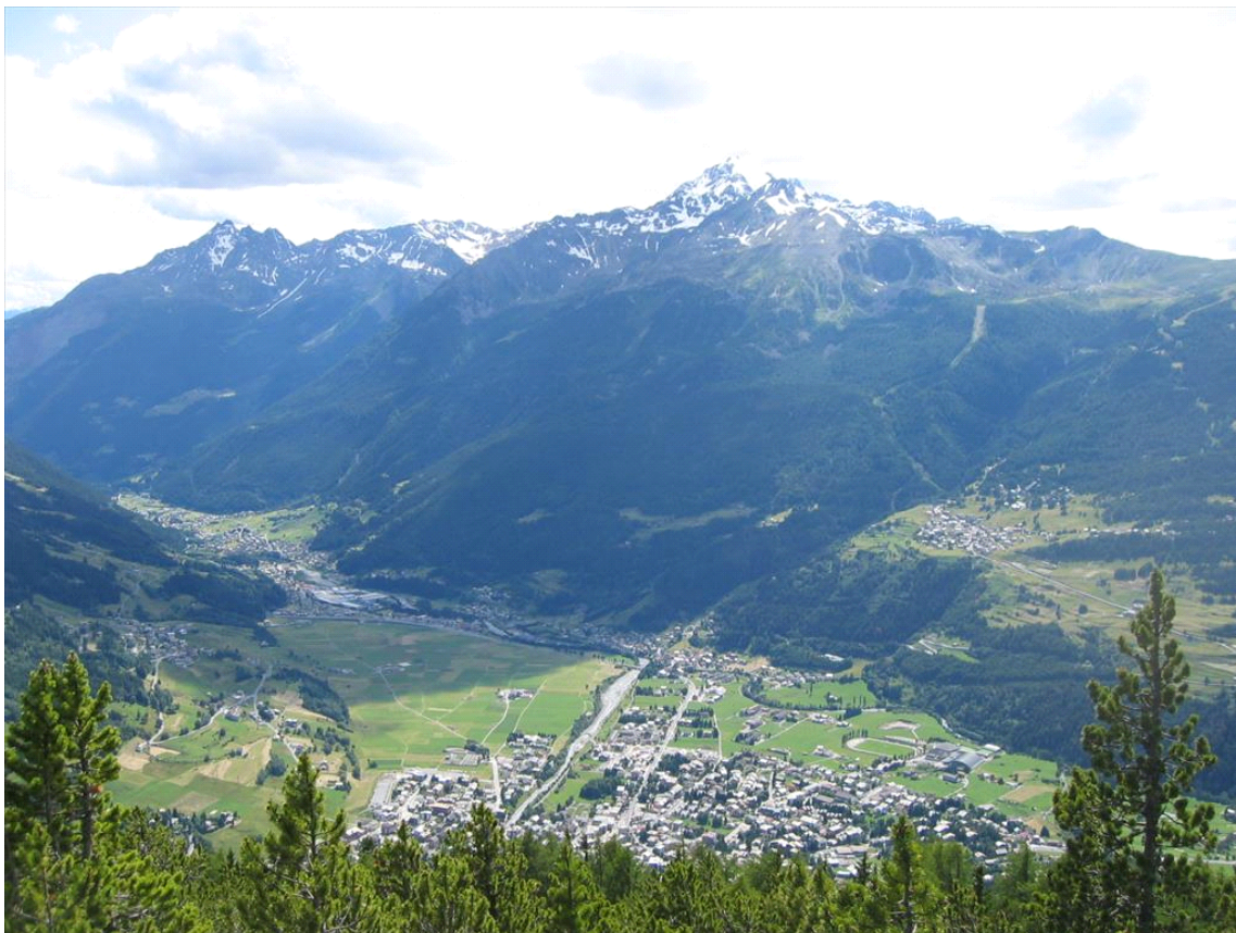
Vista su Bormio