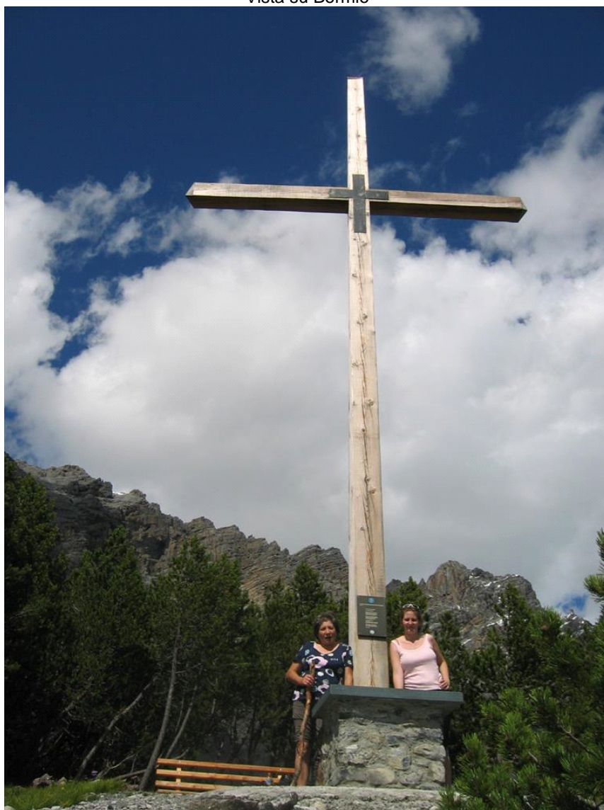
Croce della Reit