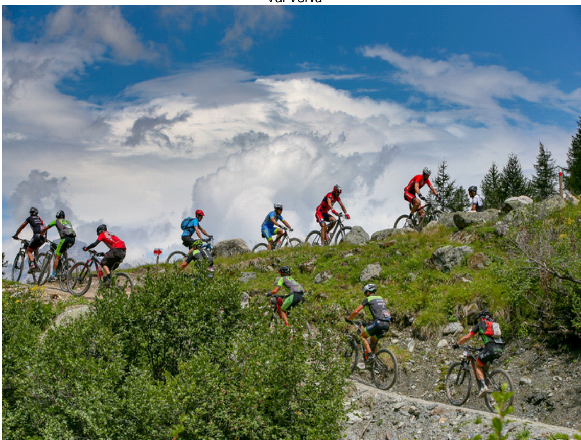
Salita in Verva bassa