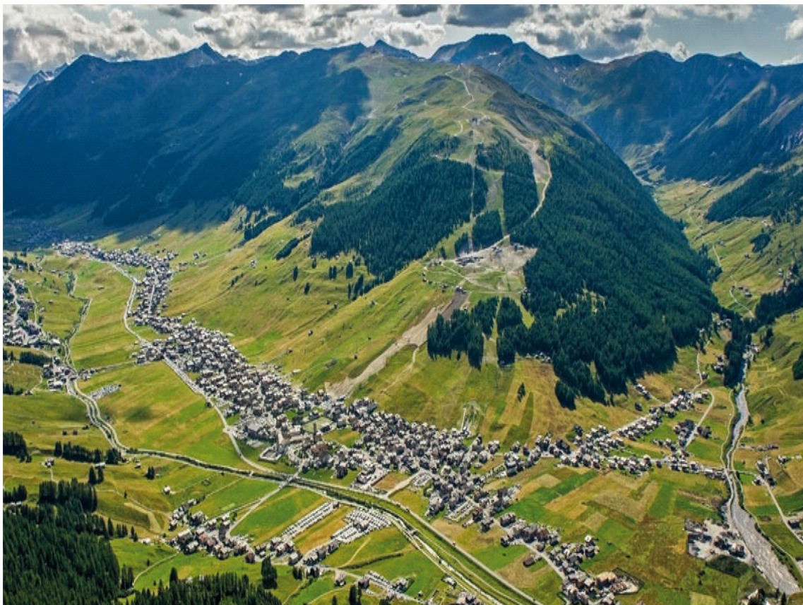
Panorama su Livigno, il Dosso Blesaccia e l'imbocco della Val Federia dal Crap de la Paré.