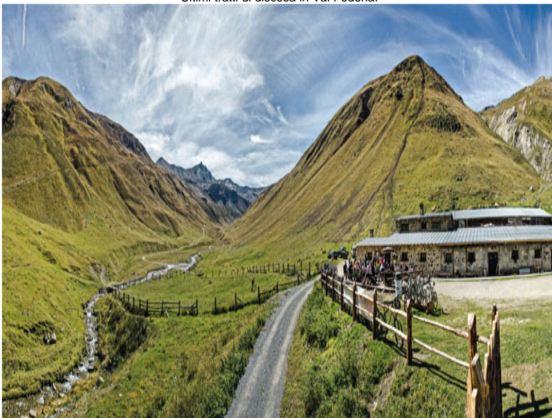
La Casera di Alta Val Federia e la meritata sosta dei bikers.

This publication is for information purposes only. We recommend you consult and check the weather forecast and snow conditions before every excursion.