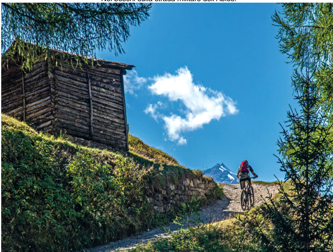
La breve salita verso Pradaccio. Sullo sfondo la Cima Piazzzi.