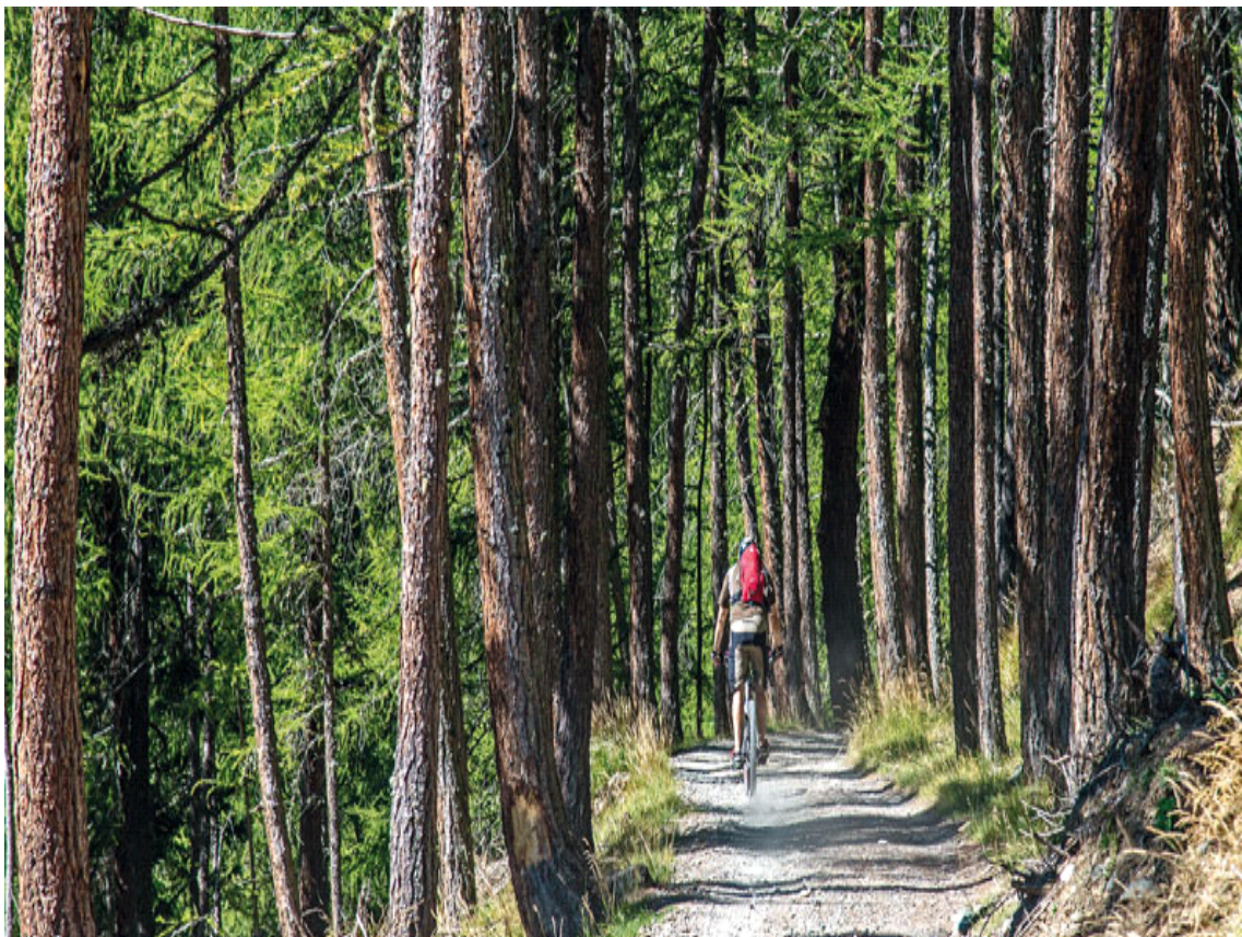
Nei boschi sulla strada militare dell'Ables.