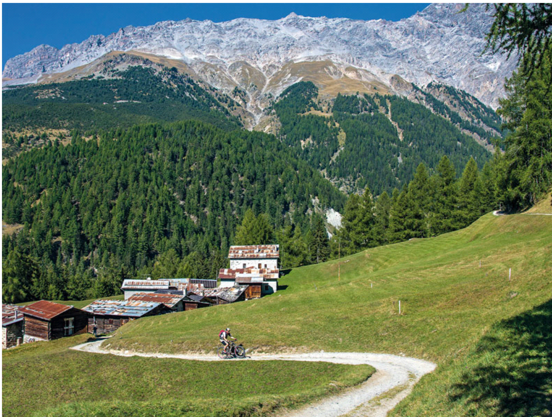
Pradaccio di Sotto