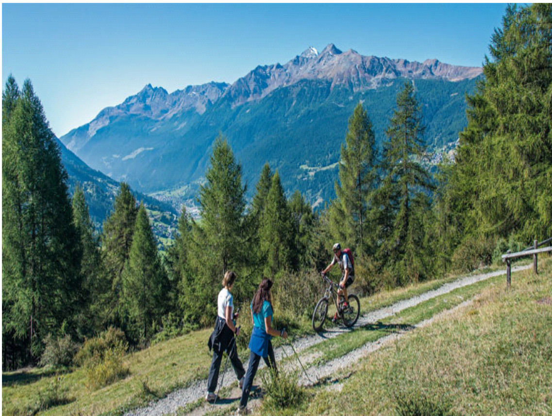
Incontri lungo l'itinerario.