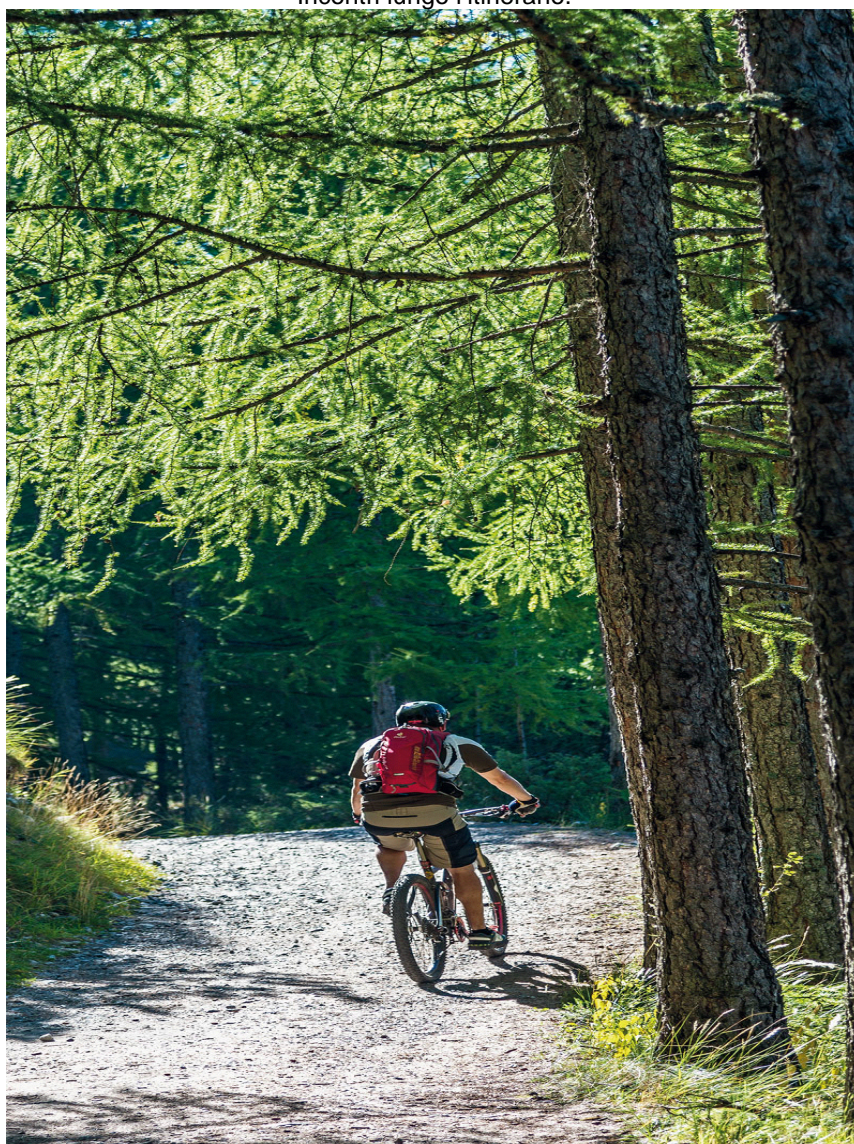
Nel bosco della Reit.