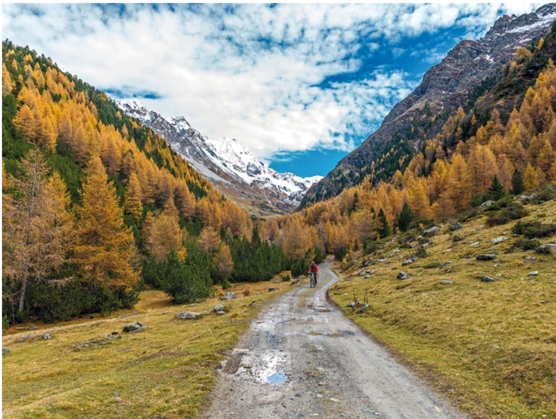
Pedalando dalla Baita del Pastore.

This publication is for information purposes only. We recommend you consult and check the weather forecast and snow conditions before every excursion.