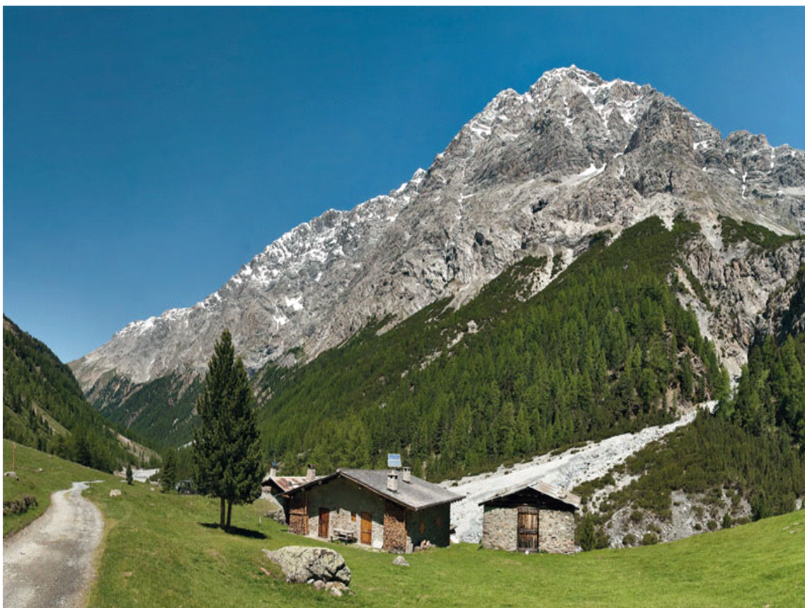
Le baite Campo di Mezzo. Sullo sfondo le Cime di Campo e il Sasso Rotondo