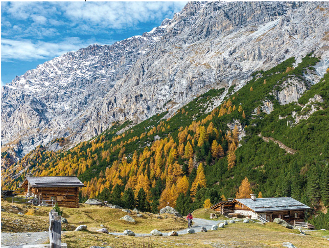
Baite Campo di Mezzo.